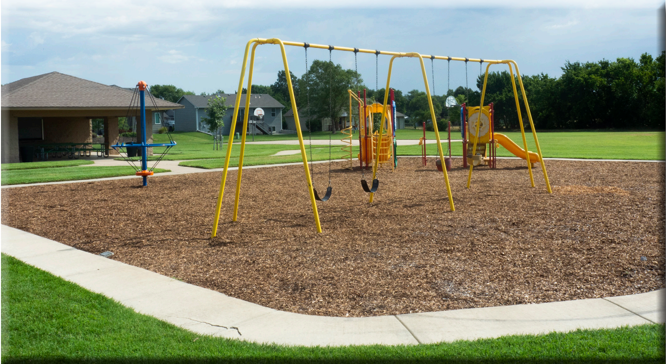
Kirby Park and Shelter