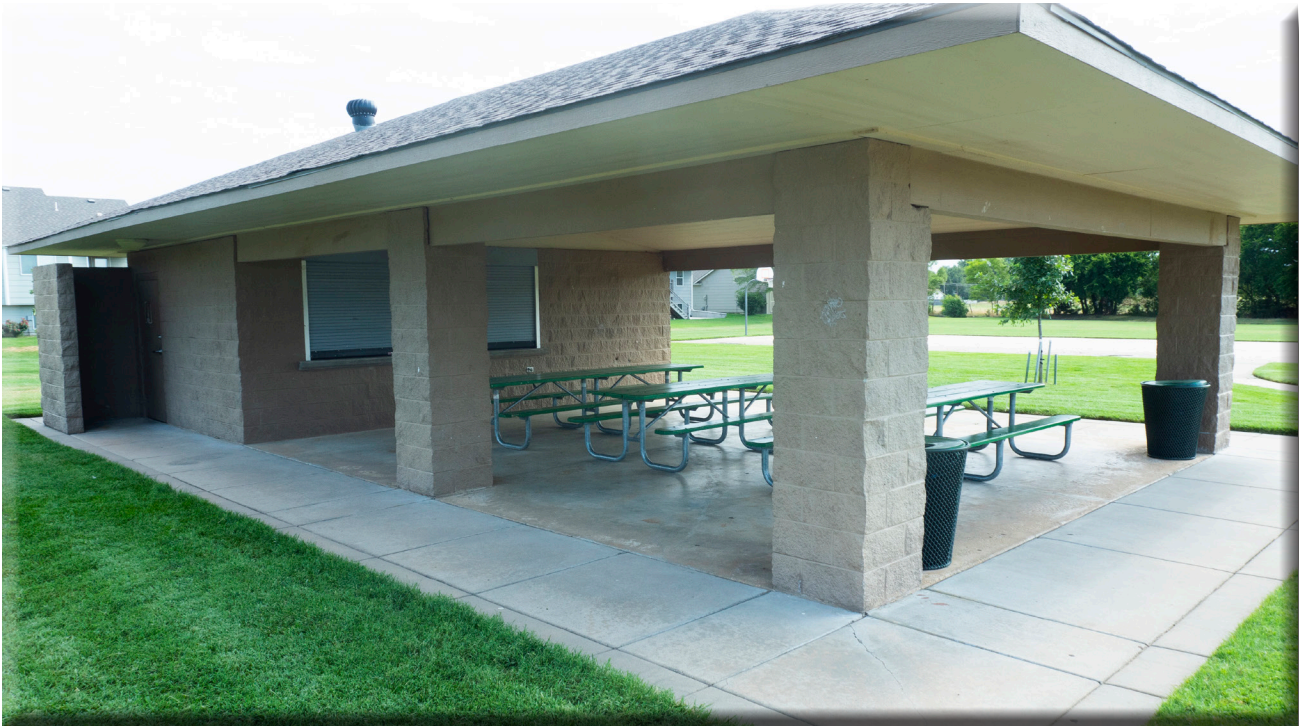
Kirby Park Shelter