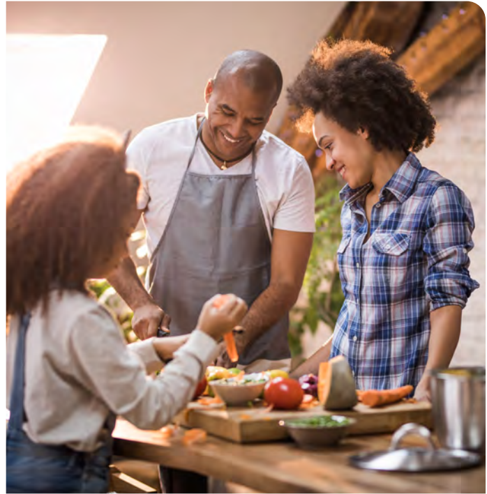
Improving your diet is one of the many things you can do to improve your heart health.