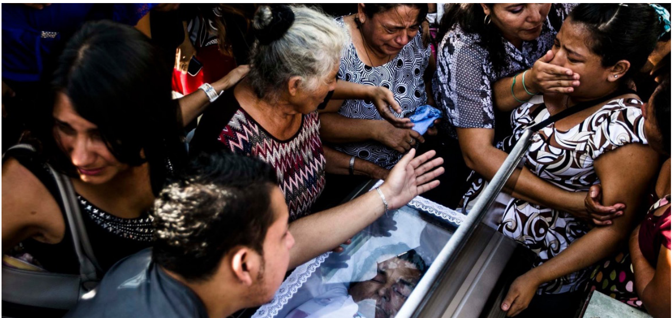
Photo caption: Family members gather at the funeral for a bus driver murdered by the Maras in Aguilares, El Salvador in September 2016.

While it has been long established that the gang leaders had directly negotiated with leaders of El Salvador’s two main political parties, the magnitude of what was negotiated has recently come to light. Over the past year, the MS 13 has posted a series of YouTube videos and audio recordings of their leadership directly negotiating with leaders of the two main political parties, the right wing Republican Nationalist Alliance ( Alianza Republicana Nacionalista – ARENA ) and the former guerrillas of the Farabundo Marti National Liberation Front ( Frente Farabundo Marti Para la Liberación Nacional – FMLN ), for monetary gain and political power.