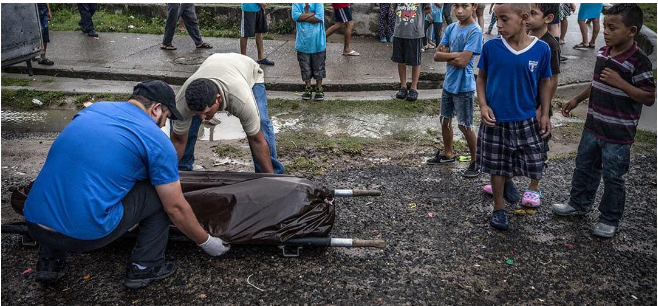
Photo caption: A victim of gang violence is taken away in San Pedro de Sula in 2016.

The November 2017 elections in Honduras heralded a seismic shift in the MS 13's political involvement. In stark contrast to prior contests, the organization took the unprecedented step of allying itself with a particular ideology, and engaged in overt political violence in concert with some of the region's criminalized populist movements from around the region in an attempt to reshape the country's political order.