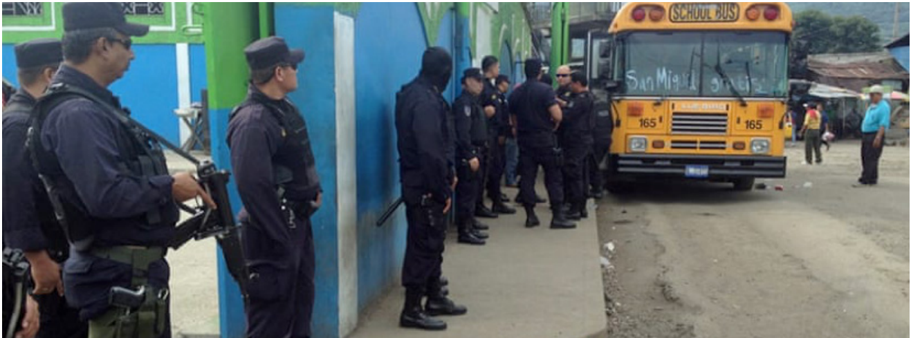
Photo caption: A heavy police presence is visible in many Salvadoran cities because of extreme gang violence.

“We have our new orders from the new business structure of our organization,” said one midlevel MS 13 leader during a November interview in San Pedro Sula, Honduras. “All we care about is drugs, how to get it, how to move it, how to sell it. We have our territory now, and we make a lot more money. We don’t meet our leaders face to face anymore, we only talk by special telephones, for security. We all get paid now, we work set shifts, we have AK 47s and mini Uzis, we have orders not to let anyone mess with civilians. The last two years have been amazing.”