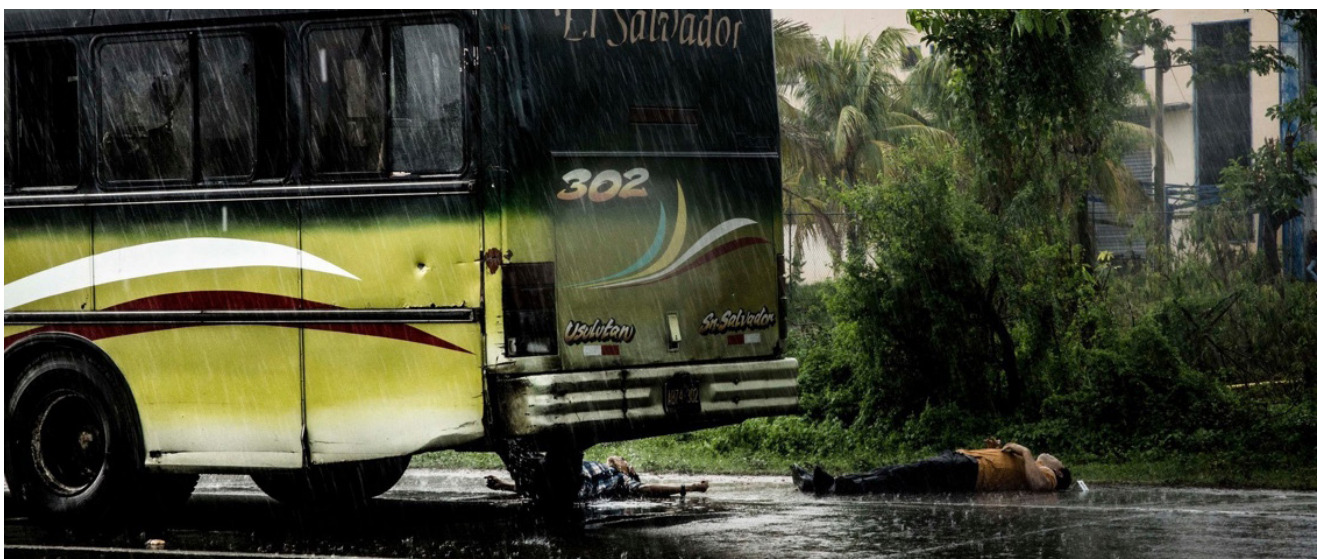
Photo caption: Victims' bodies on the ground after gang members killed six passengers in Olocuilta, El Salvador because the owner refused to pay extortion.

There are significant rumblings of changes underway inside the MS 13. Even as other gangs have fractured in El Salvador – in the case of the Barrio 18, into the Sureños and Revolucionarios - the MS 13 alone has evolved politically, militarily and economically to challenge the survival of the state. There is now considerable debate over a possible split in the MS 13 in El Salvador, between the ranfla histórica (historic gang leadership, mostly in prison) and the ranfla libre (gang leaders on the outside