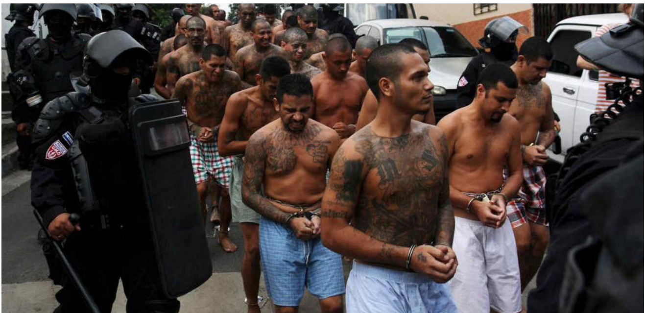
Photo caption: Members of the Mara Salvatrucha arrested in El Salvador in 2016.

This report draws upon findings from field investigations by seven researchers throughout the Northern Triangle over the past year. During that time, we conducted interviews with gang leaders of both the MS 13 and Barrio 18 gangs; residents of gang-controlled territory; law enforcement officials; journalists; and academics.