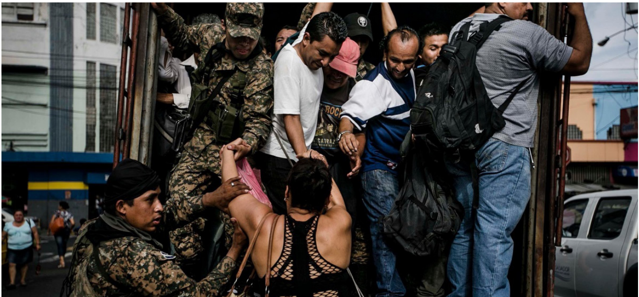
Photo caption: Soldiers guard civilians in El Salvador after gangs threatened to kill bus drivers who don't pay extortion.

The MS 13 has never before participated in such a broad, mainstream movement with formal political power. Similarly, the regional Bolivarian movement 16 has never previously enjoyed access to allies with significant territorial control in Honduras. In our assessment, the advantages of a closer alliance between these two entities would provide benefits to both sides while continuing to operate independently in most areas.