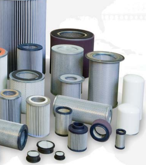
Vacuum Assisted Oil Mist Eliminator