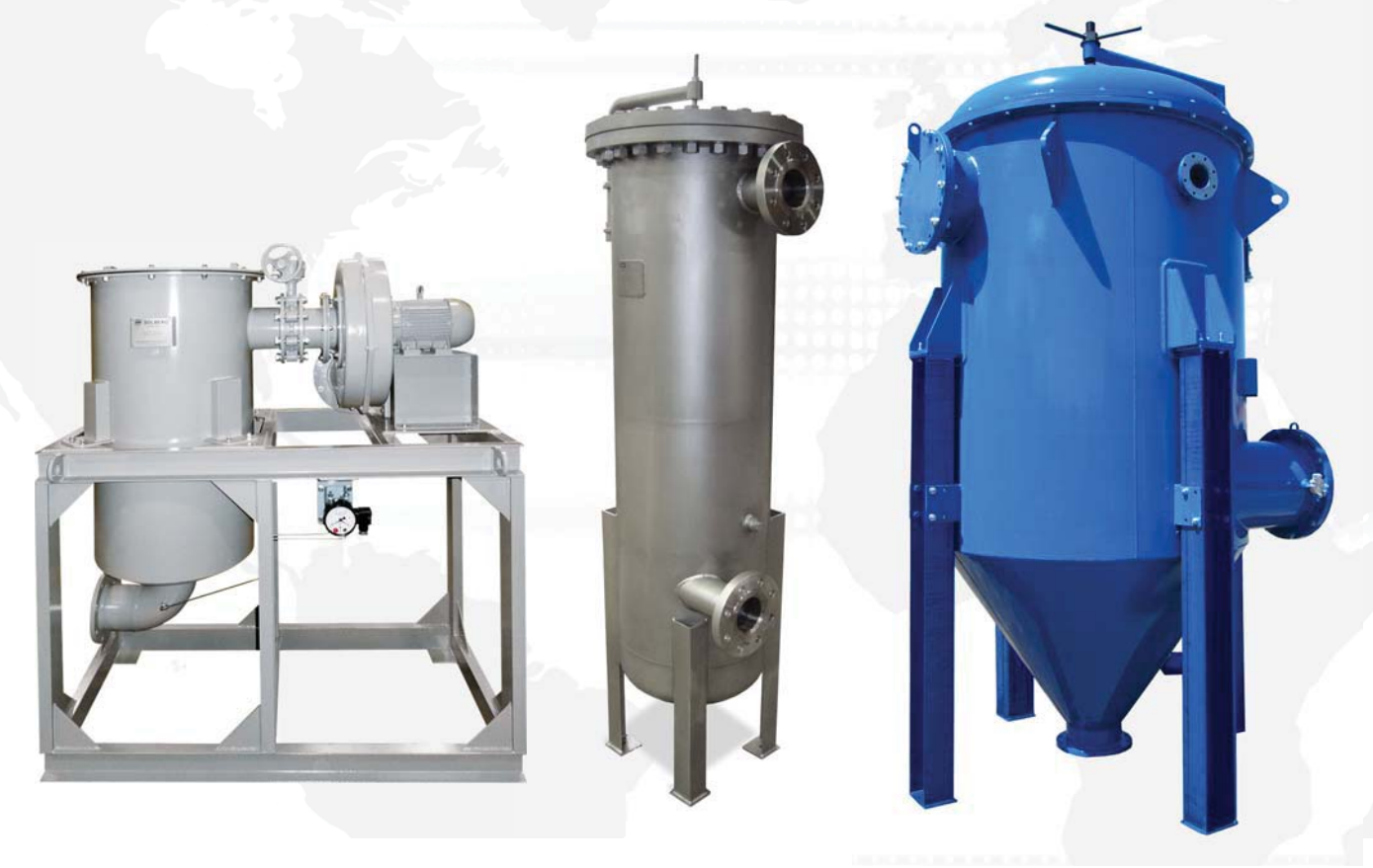
Unique Applications (Medical, Chemical Resistant Finish, Reverse Pulse)