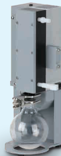
Peltronic® emission condenser

The Peltronic® emission condenser performs condensation of solvent vapors without external coolant such as water or dry ice. It works electronically and uses Peltier elements as cooling system. All wetted parts are highly chemically resistant. The condenser is especially designed to be added to existing pumping units and allows the replacement of common condensers working with external coolant. The condenser is ideally suited for applications where cooling water is not available or desired, or in case of cost and productivity concerns associated with dry ice condensers. It is often used to reduce cooling water usage for environmental reasons or to prevent the risk of flooding from cooling water plumbing leakage. This frequently is requested for vacuum networks built into lab furniture. If the Peltronic® is connected to a CVC 3000 vacuum controller it is switched on/off automatically on demand.