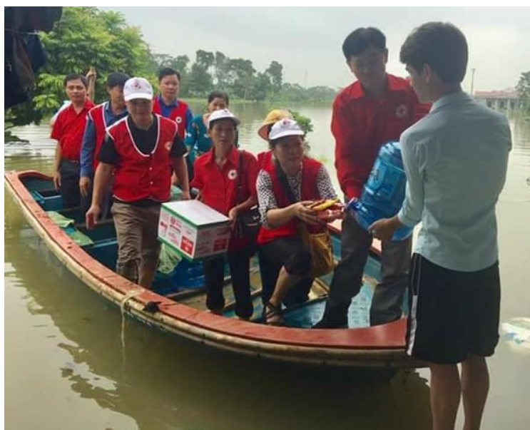
VNRC is one of the first responders in Nghia Lo, Yen Bai province where many households were affected by the flash flood.

<click here for detailed contact information>