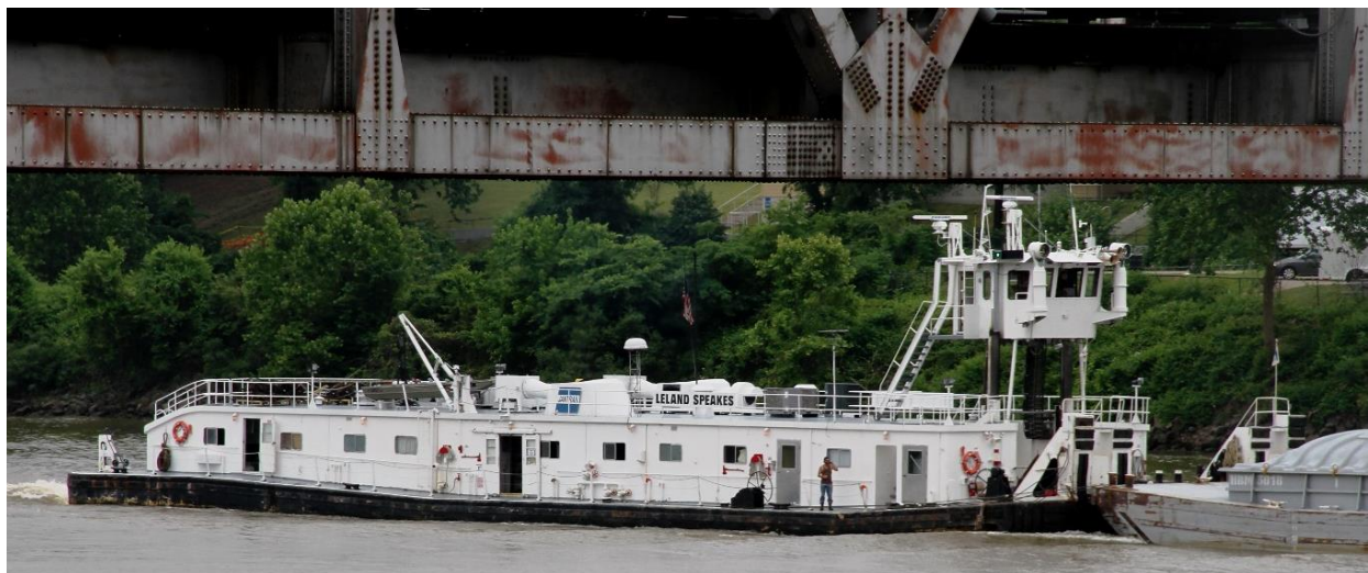
Leland Speakes before the accident.

On February 21, 2018, at 0740, the towing vessel Leland Speakes was pushing 21 barges upbound on the Lower Mississippi River when a fire broke out in the engine room at mile 520.6, south of Greenville, Mississippi. The nine crewmembers on board tried to fight the fire but, unable to control it, abandoned the vessel to a skiff dispatched from a Good Samaritan towboat. The abandoned tow drifted 11 miles downriver until another towing vessel pushed it into a sandbar. The fire burned until later that evening before being extinguished by fire response teams and vessels. None of the crewmembers were injured, and no environmental damage was reported. The damage to the Leland Speakes was estimated at $4.5–5 million.