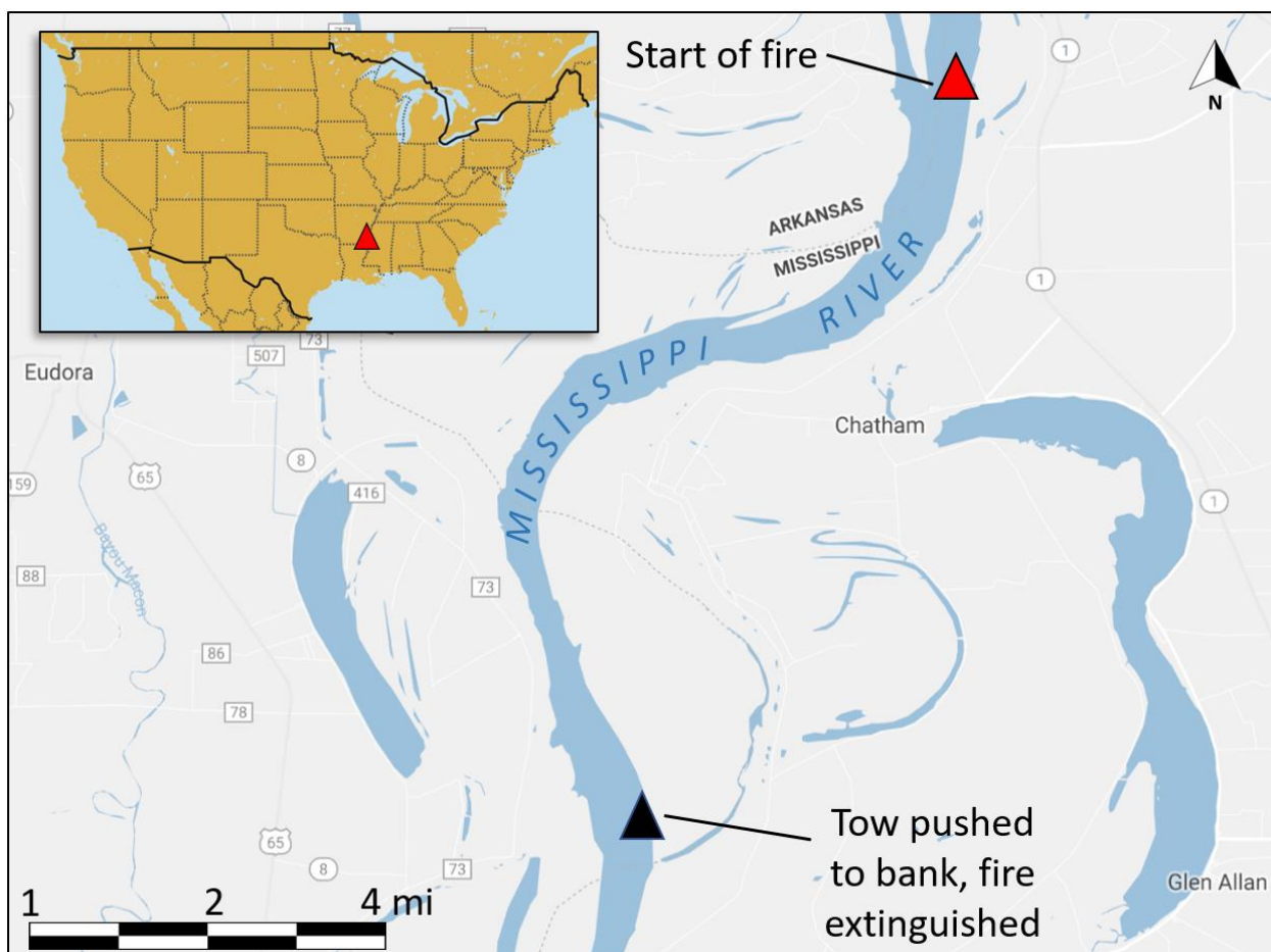
Map of area where Leland Speakes caught fire and drifted on the Lower Mississippi River.

During the early morning of February 21, 2018, the Leland Speakes was pushing a tow up the Lower Mississippi River, en route to the Jantran facility near mile 585 in Rosedale. The towboat's nine crewmembers included a captain, second mate, mate, a pilot, three deckhands, an engineer, and a cook. Its tow consisted of 21 dry-cargo barges—configured 7 barges long by 3 barges wide—with the Leland Speakes faced up (connected) and pushing from behind. Seven barges at the head of the tow were empty.