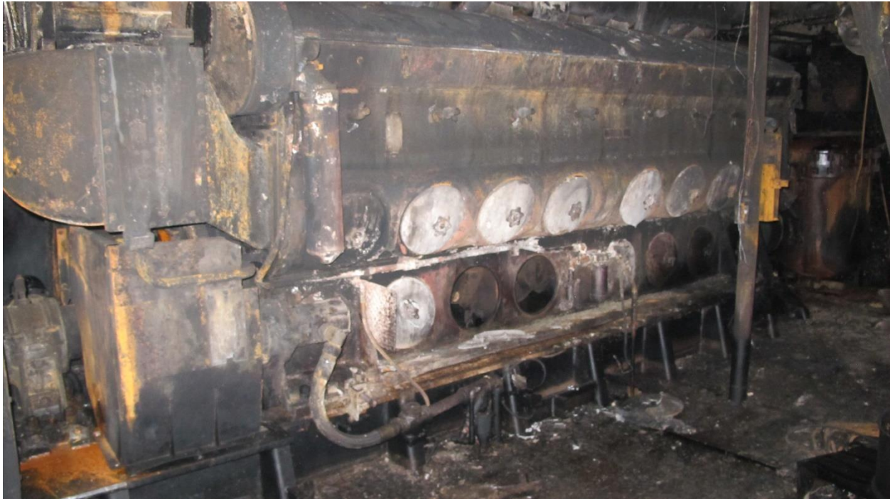
Postaccident photo of the inboard side of Leland Speakes ' port main engine at the lower engine room level.

“... the cap securing both No. 16 and No. 8 connecting rods to the crankshaft failed, which propelled the No. 8 piston and rod through the opposite crankcase inspection port. Given the absence of the piston, all fuel injected into the No. 8 cylinder flowed into the crankcase which apparently, due to friction caused by the failure had reached temperatures capable of igniting the fuel and/or oil in the vicinity.”