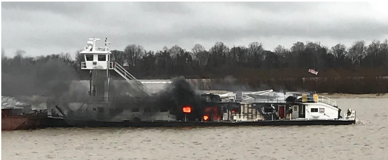
Leland Speakes on fire and abandoned at 1249.

As a result of the fire, all main deck house and interior spaces were damaged, distorted, or destroyed, except for the steering room and portions of a deck locker. All machinery, electrical components, and accessories in the lower engine room and shaft alley suffered heat damage. The port main engine sustained severe damage to its engine block, crankshaft, and piston components.