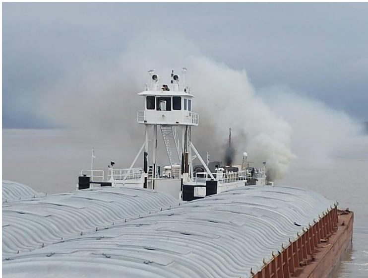
Towboat Leland Speakes on fire after abandonment.

In the wheelhouse, the captain slowed the engines (reduced rpm) and took them out of gear (neutral position). 3 He noticed that the tow began to "top around" (turn from upbound to downbound) toward the left descending bank. Seeing that the port engine had now lost all rpm, the captain put the starboard engine back in gear, applied port rudder to counteract the starboard movement, and began increasing the throttle. The vessel did not respond to the rudder command. Realizing that he had lost steering, he took the starboard engine out of gear and called out on VHF radio that the Leland Speakes was on fire and had lost steering. The crew of nearby towing vessel Gabe Gattle replied that they were launching their skiff to assist.