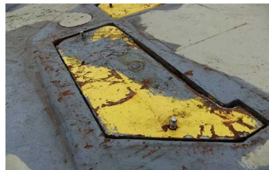
Figure 2. - Retracted shark jaws on Bourbon Rhesos 3

During anchor handling activities, the manufacturer recommends maintenance of the shark jaws to be carried out once every week. One maintenance item is to remove the inspection covers at the side of the housing and to clean and remove sand, mud or any obstructions from