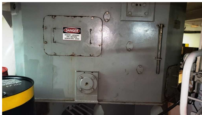
Figure 3. – Shark jaws inspection cover on Bourbon Rhesos 4

the inside of the housing frame. Upon completion of the maintenance, the inspection covers are to be installed with silicone sealant / gasket.