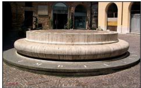
Fig. 1. The Italy's center inside Rieti (source: www.orvietonews.it )

Regarding Rieti, the ancient Roman scholar and writer Varro (116-27 BC) was the first historical figure to mention that Rieti Valley was in the middle of the peninsula. The ancient Roman poet Virgil (70-19 BC), in the VII book of the Aeneid, says: Est locus Italiae in medio, sub montibus altis where the term locus is interpreted by many scholars as the Rieti plain. During the Middle Age, Rieti continued to be held in Italy as its center. In fact, at that time, people said, with regard to the width of Italy by the Adriatic Sea to the Tyrrhenian Sea, it was 52 Italian miles (1 Italian mile = 1851.51 m) from both sides respect to Rieti; the same reasoning for the length north-south, 310 Italian miles to Augusta Pretoria (Aosta) and 310 miles to Cape dell'Armi (Calabria). The tradition, later, localized definitely the Umbilicus within the city of Rieti and precisely in the St. Rufus square. There was placed a column of granite that remained there until 1800, when it was buried in the same place where it was built and replaced with a stone with carved above Medium Totius Italiae . This stone was replaced, in turn, by the current headstone at March 29 th , 1950 with the inscription CENTRE OF ITALY in 20 languages (Fig. 1).