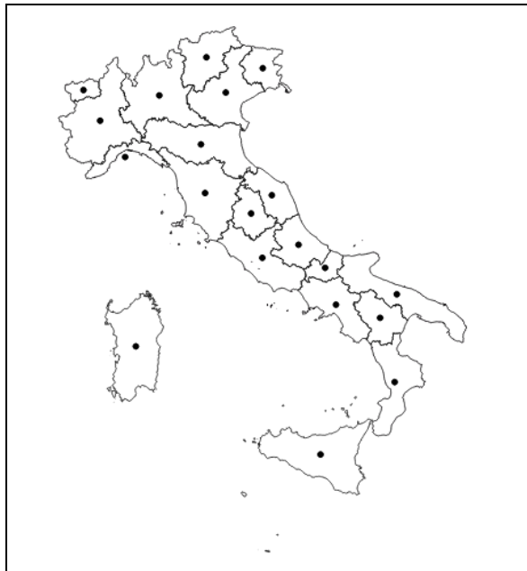
Fig. 4. The centers of each Italian region (black dots) calculated with QGIS 2.2. Note the center of Liguria in the sea.