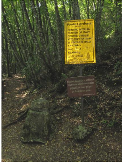
Fig. 2. The small monument indicating the center of Italy at Narni (TR). Note that over signs are not written coordinates.

In 2013, a national newspaper [4] published an article alleging that the center was near Narni. The real center, in fact, should be placed in Torre Spaccata (RM) in via Marcio Rutilio. Even in this case, the used calculation method was not stated.