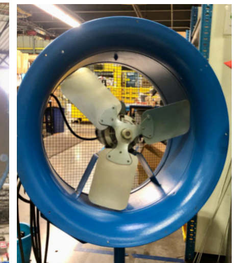
(Above) Several before and after industrial cleaning photos.