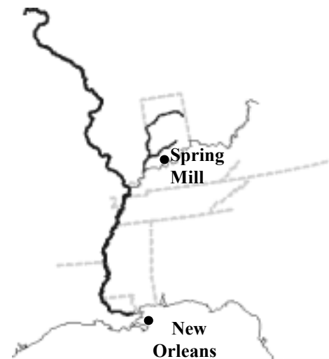
Flatboat route from Spring Mill to New Orleans