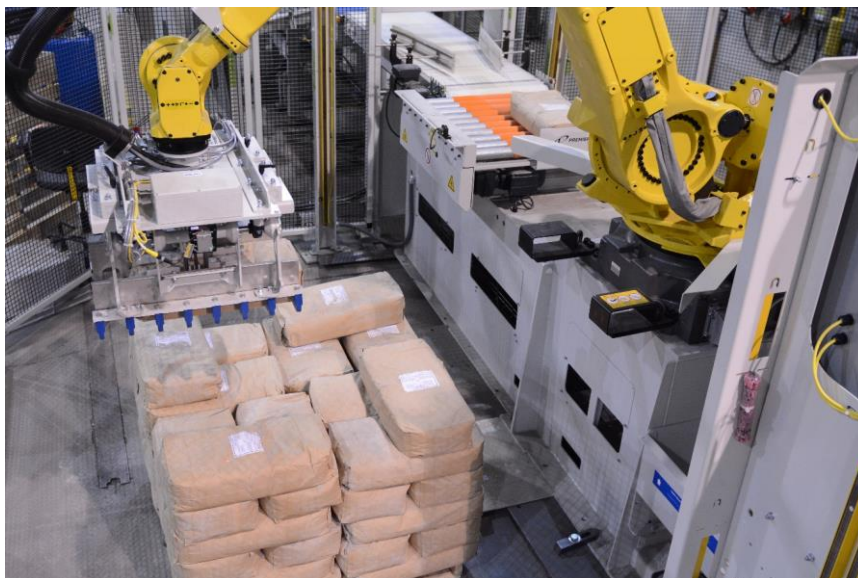
Figure 6: A case for Robotic palletization

Human workers will always have a role in industrial operations, there is simply too many touchpoints that can't realistically be handled by robots. However, there is no reason to keep your workers in situations that are dangerous, or that have long term effects on their health. Adding a robotic palletizer is not only an investment in your productivity, but also an investment in your most important resource: your team.