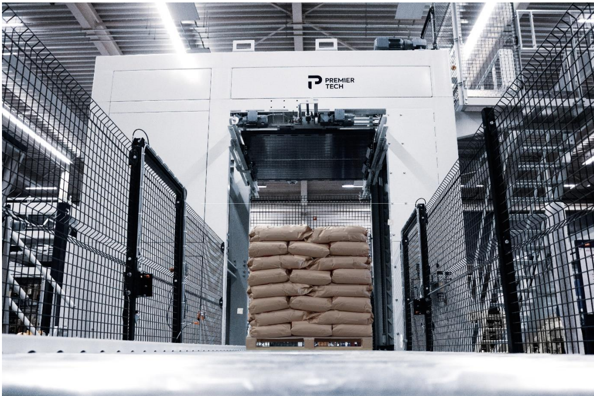
Figure 2: Bag palletization

Bag palletizing is one of the most common ways of transporting products. It can be done using various types of bags, from paper, plastic or a hybrid depending on the type of product being carried. Bags are usually favoured because they can be filled directly on the production line and are very efficient for products sold by volume. There is a myriad of patterns that have been invented to optimize the way you set up the bags on your pallets but also to protect the product.