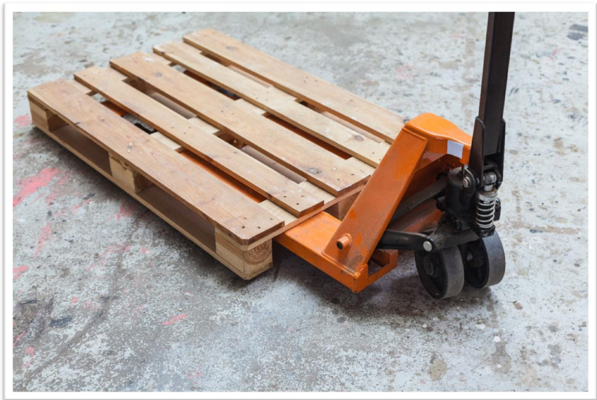
Figure 1: A typical Pallet

The pallet, typically a form of tertiary packaging, is a flat structure used as a base for the unitization of goods in the supply chain. The MH1-2016 standard defines the pallet as a “portable, horizontal, rigid, composite platform used as (a) base for assembling, storing, stacking, handling and transporting goods as a unit load; often equipped with (a) superstructure.” The superstructure is the assembly that is attached to the supporting base of the pallet.