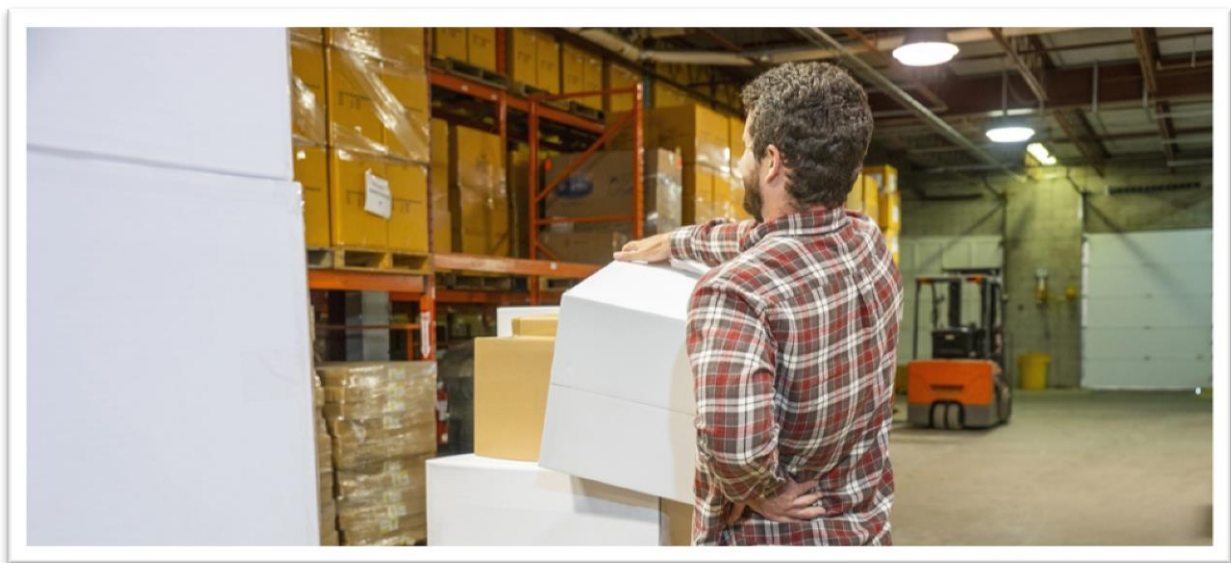
Figure 5: Injury risks using manual palletization

Heavy weights being carried by workers cause back strain, even when correct lifting techniques are being used. The same can be said for repetitive motions causing stress on muscle tissue. Industrial workplaces and techniques have greatly evolved but these are limitations of the human body. Even the best methods of lifting weights and managing the movements found on a production line are never optimal for your employees in the long run.