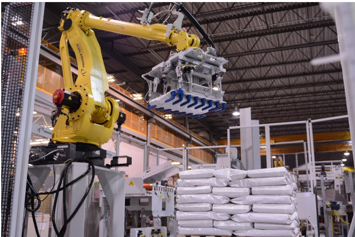
Figure 4: Robot-Enabled Palletization from PT Systems & Automation

Like many industries across the world, palletizing was revolutionized by the advent of automation and robotics. Robotic palletizers are essentially large robotic arms that load products onto pallets and then move the entire pallet to its next location. Not only can they lift much heavier weights than human workers, but they also eliminate repetitive movements that can have long term consequences on the bodies of your employees. They are also extremely precise and can be customized with a variety of end of arm tooling to perfectly fit your needs.