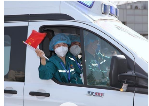
YRCC medical staff is coming back from Wuhan town

regarding how we fight the Yellow River Floods in the history, very similar strategy and methodology was used.