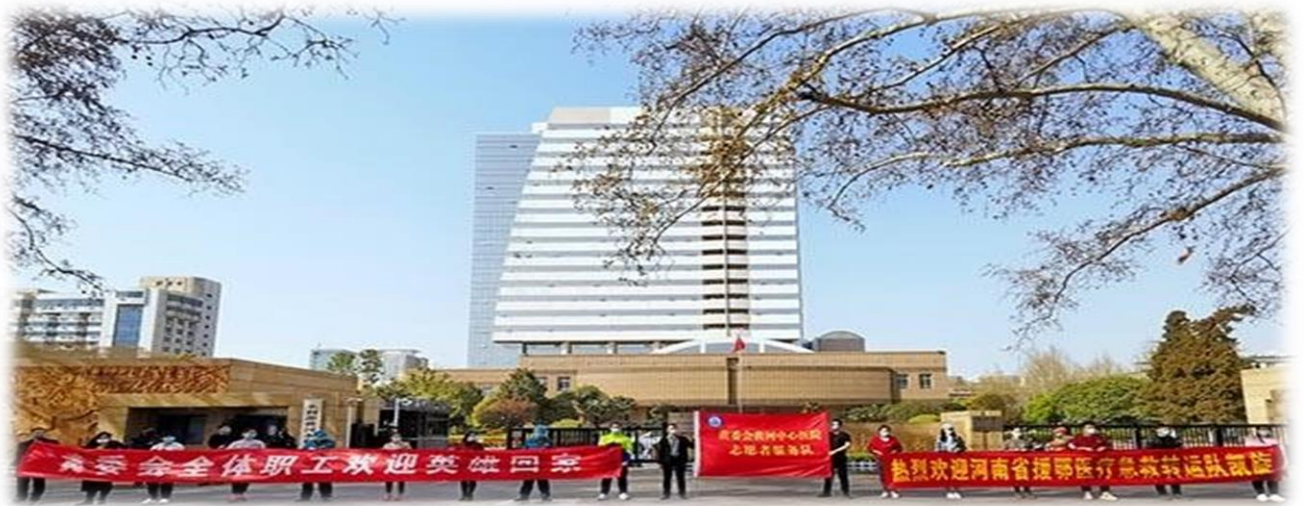
Translation of the banners:

but by the last few country who defeat the virus, only at that time we are all safe, and we hope China's experience send a signal of the light at the end of the tunnel.