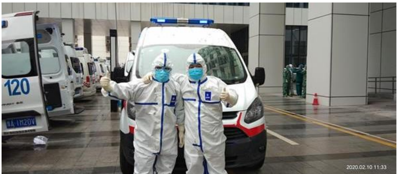
Reinforcement of the medical teams of the Yellow River Conservation Commission in Wuhan

Faced with the enormous, completely unexpected and rapidly evolving crisis, Yellow River Conservancy Commission put the safety of its 40000 staff into the highest priority. At very early stage, YRCC started to inform the daily epidemic situation to each individual staff and setup health record for them to trace their location and health condition, and provide necessary support if needed. After the holiday, YRCC allow only necessary and limited staff return to office, and encourage most of the staff working at home through video/audio conference. Early spring usually bring Yellow River the ice melting floods in the upper reach and the water demand for Irrigation and environment in the lower reach, this year YRCC put the flood prevention and water allocation stakeholder consultation meeting online and allocate the water resources by the remote control center, which also works quite well. Today, the YRCC office has already returned to normal business, but fighting COVID-19 is not over, it is still encouraged to wear face mask and to avoid public gathering and travel.