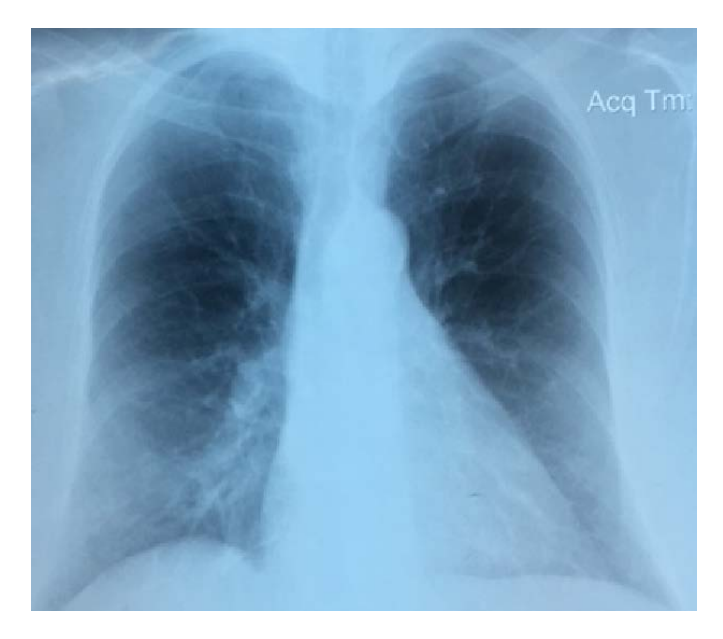
FIGURE 1. Posteroanterior chest X-ray: reticular, net-like shadowing of the lung, more predominant towards the lung bases; bilateral, middle-zone emphysema.

To exclude other etiologies regarding the patient's symptoms, several tests were made, including nasal and pharyngeal swab (both came back negative), thyroid hormone test (within normal range), as well as thyroid