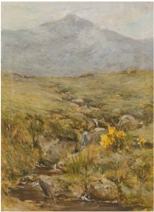
An Arran Hillside

John Lamont Brodie is a rather shadowy figure but his profession seems to have been that of a portrait painter. He was born in St. Dunstan, London sometime between 1824 and 1827 and he is recorded as living at 5 Clarence Street, Greenock in between 1845 and 1846. By 1851 he had returned to England, living at 126 Albany Street and 1 Willoughby Place, London between 1851 and 1871. In the 1850s and 1860s he also appears to have regularly travelled to Manchester, maintaining an address there and also exhibiting there. In 1871 he moved to 21 Bedford Square Brighton before returning to London and living at 5 Denmark Hill, Wimbledon in 1881. He died at Louder House, Wimbledon on 23rd November 1898.