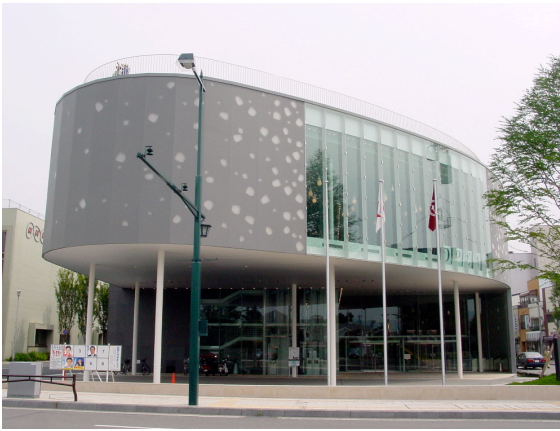
Figure 5 Matsumoto PAC exterior