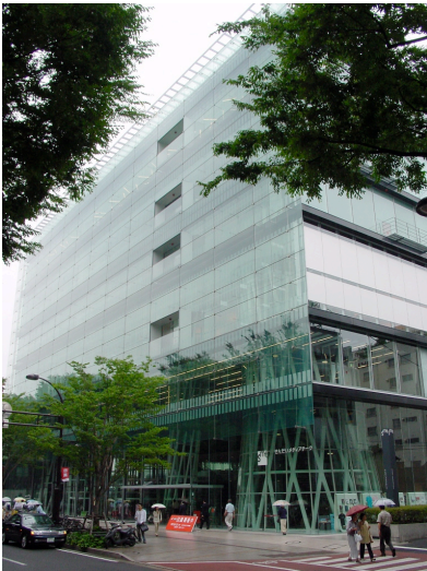
Figure 4 Sendai Mediatheque ground floor