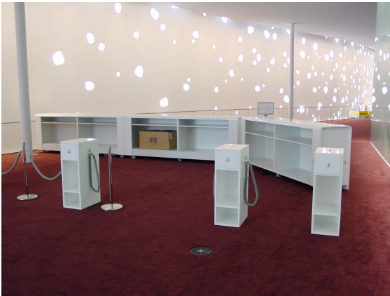
Figure 11 Rehearsal room/roof garden