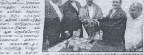
பாடல் பட்டம் பெற வழங்கியுக் பாட்டு. பாடல் பட்டம் பெற வழங்கியுக் பாட்டு.