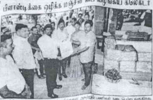
திருச்சி மாவட்ட திட்ட மேலாண்மை அலுவலர் குழு. பெற்று வருகிறது. திட்ட மேலாண்மை அலுவலர் குழு. பெற்று வருகிறது.

மாணவ மலர் 15-2-2023 (புதின்கிழமை) விதிகளை அமல்படுத்துவதில் ரெயிடில்வே அதிகாரிகள் தவறலாமா? சென்னை, 15-2-2023: ரெயில்வே துறையில் பணியாற்றும் அதிகாரிகள், விதிகளை அமல்படுத்துவதில் தவறலாமா? என்று கேள்வி எழும்புகிறது. ரெயில்வே துறையில் பணியாற்றும் அதிகாரிகள், விதிகளை அமல்படுத்துவதில் தவறலாமா? என்று கேள்வி எழும்புகிறது. ரெயில்வே துறையில் பணியாற்றும் அதிகாரிகள், விதிகளை அமல்படுத்துவதில் தவறலாமா? என்று கேள்வி எழும்புகிறது.