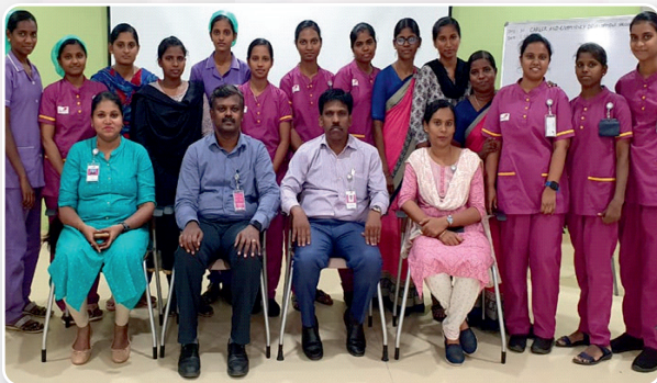
Employee Soft Skill Training