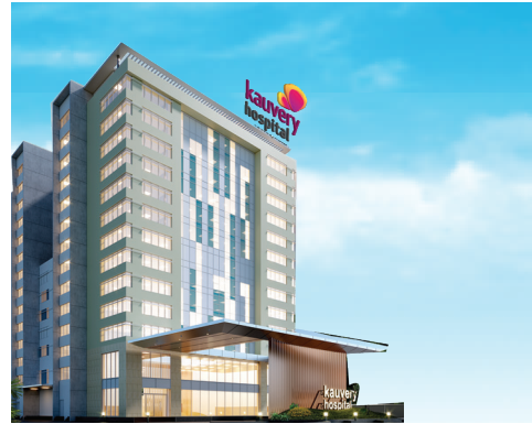
Chennai | Radial Road