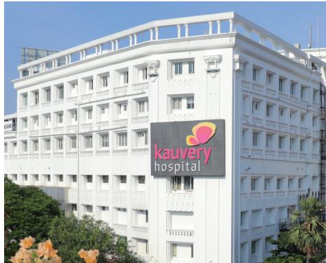
Chennai | Alwarpet