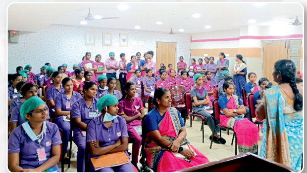
Employee Mental Wellness