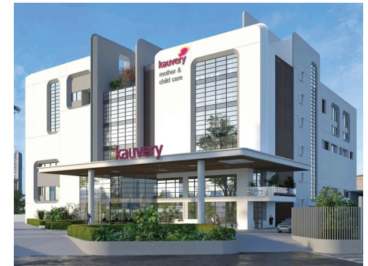
Trichy | Maa Kauvery