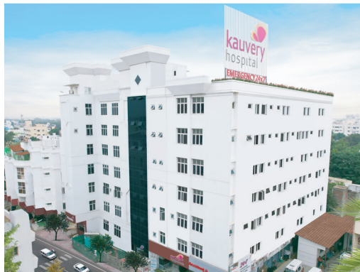
Trichy | Tennur