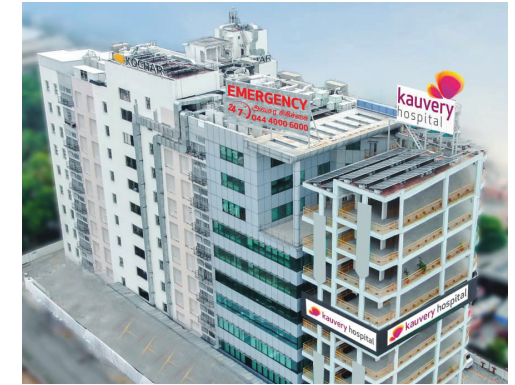
Chennai | Vadapalani