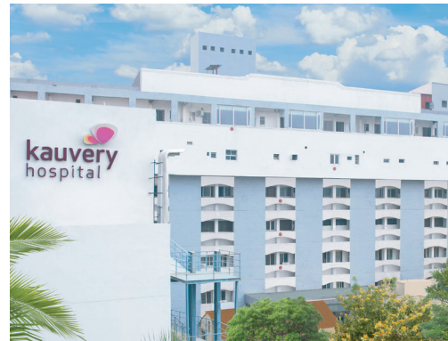
Trichy | Cantonment