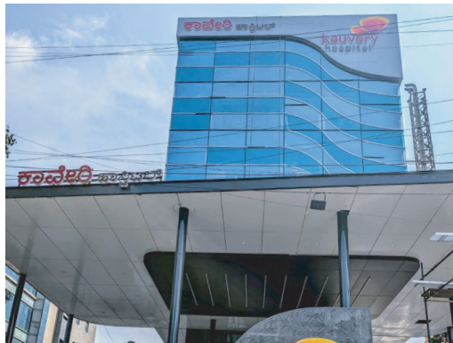
Bengaluru | Marthahalli