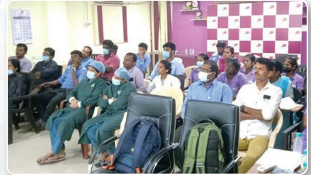
KAFFEE with Kurrency