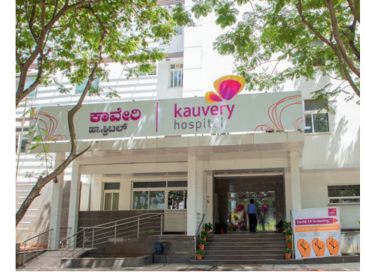
Bengaluru | Electronic City