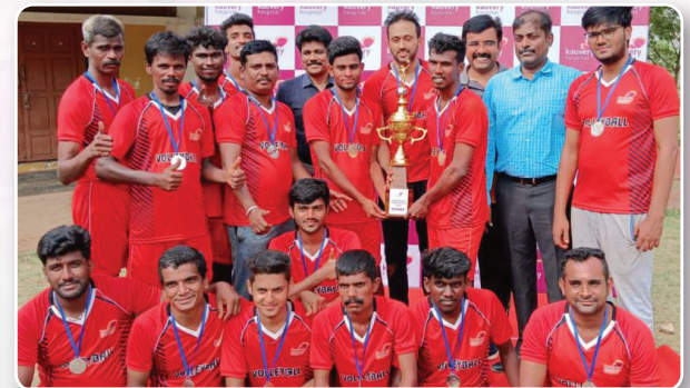
Uniting in Sportsmanship