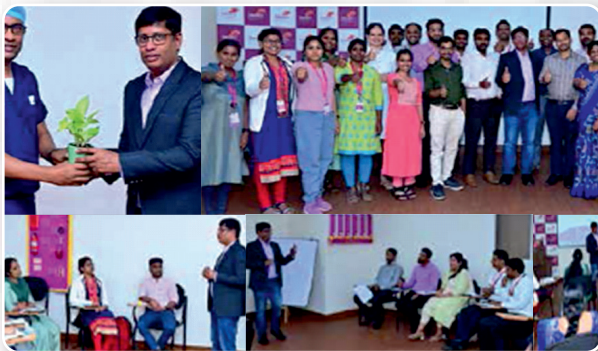
Leadership Initiative for Transformation