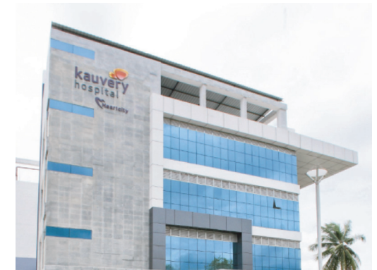
Trichy | Heartcity