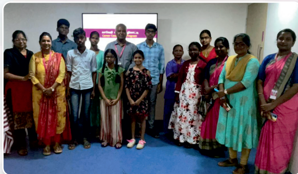
Career Guidance Program