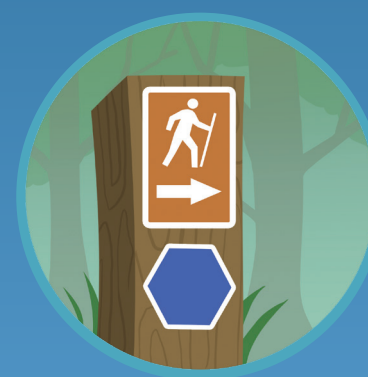
● Something Human-made