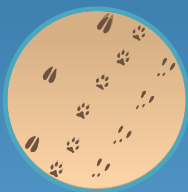
● Animal Tracks