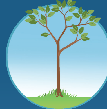
● Sapling (Young tree)