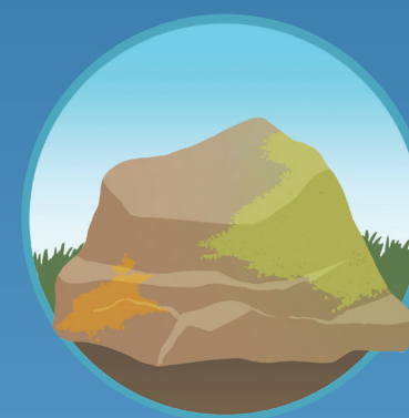
● Rock with 2 colors