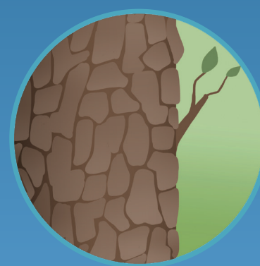
● Rough Bark