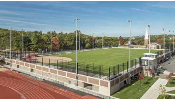
WORCESTER POLYTECHNIC INSTITUTE