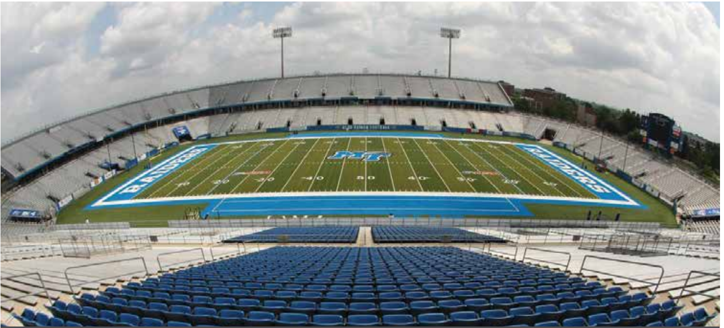
MIDDLE TENNESSEE STATE UNIVERSITY