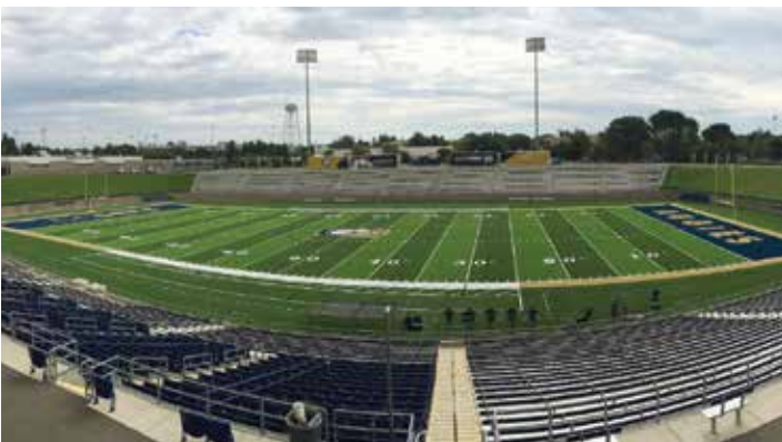
UC DAVIS // AGGIE STADIUM