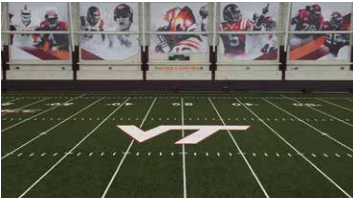
VIRGINIA TECH Blacksburg, VA