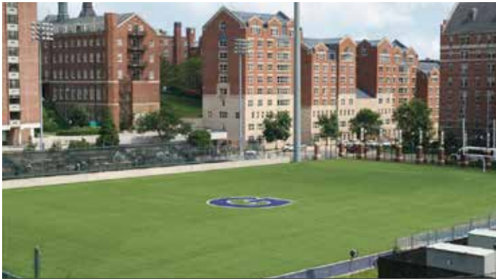
GEORGETOWN UNIVERSITY Washington, DC