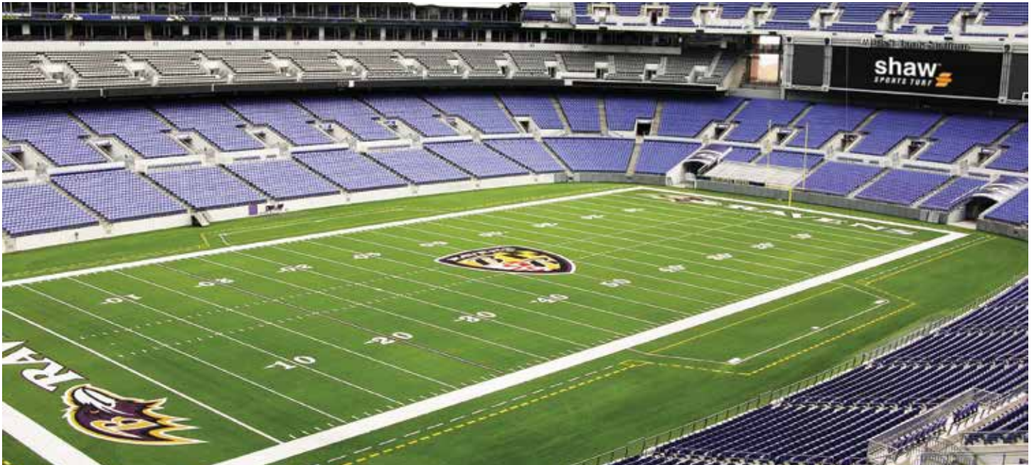
BALTIMORE RAVENS // M&T BANK STADIUM Baltimore, MD