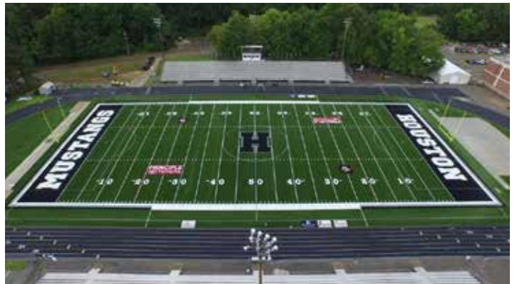
HOUSTON HIGH SCHOOL Germantown, TN