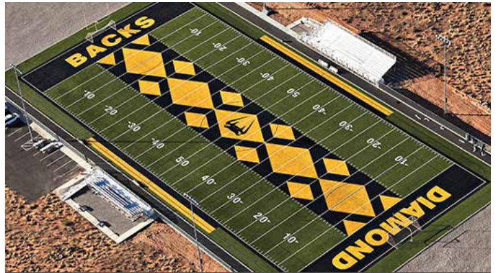
DIAMOND RANCH ACADEMY Hurricane, UT