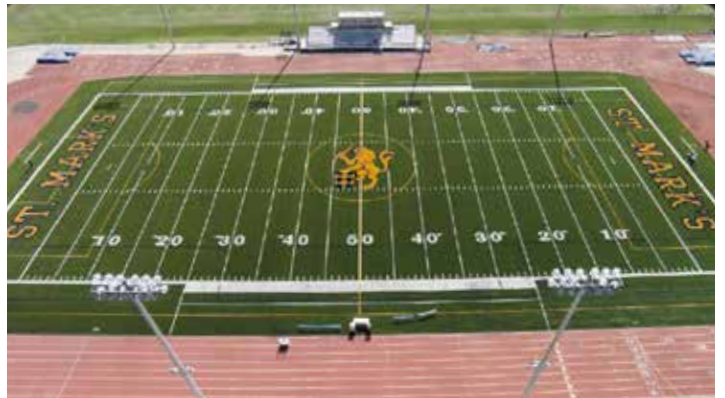
ST. MARKS SCHOOL OF TEXAS