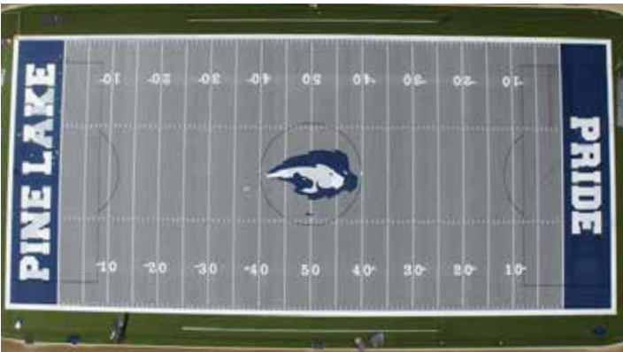
PINE LAKE PREPARATORY