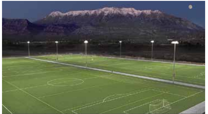
UTAH VALLEY UNIVERSITY