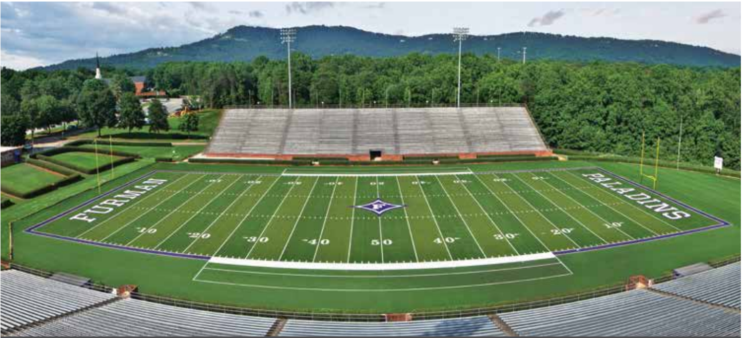
FURMAN UNIVERSITY // PALADIN STADIUM