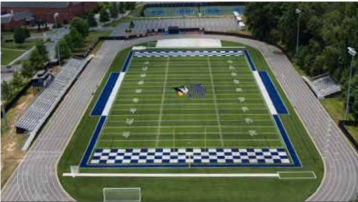
MOUNT PARAN CHRISTIAN SCHOOL