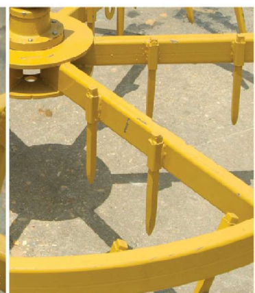
Sleeve Mounted Spikes