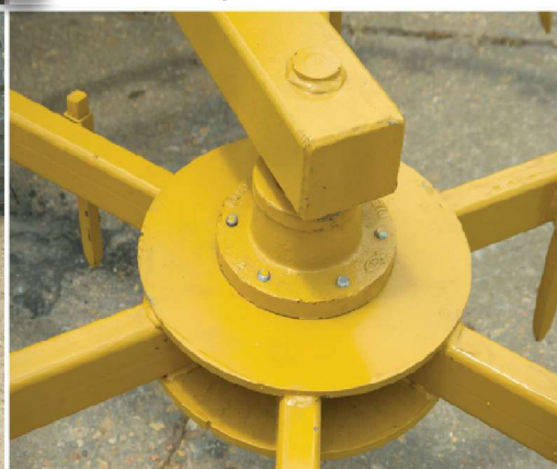
Bolt On Hub with Sealed Bearings