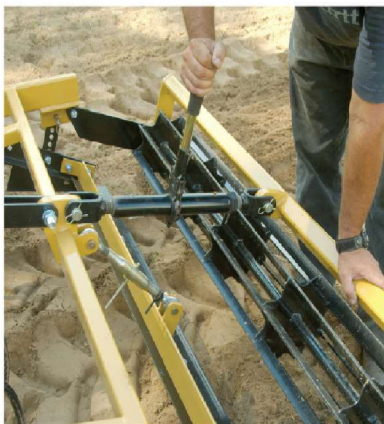
Easy Adjust Crumbling Basket