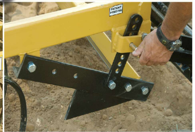
Adjustable Smoother Bar