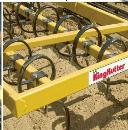
High Vibration Tines