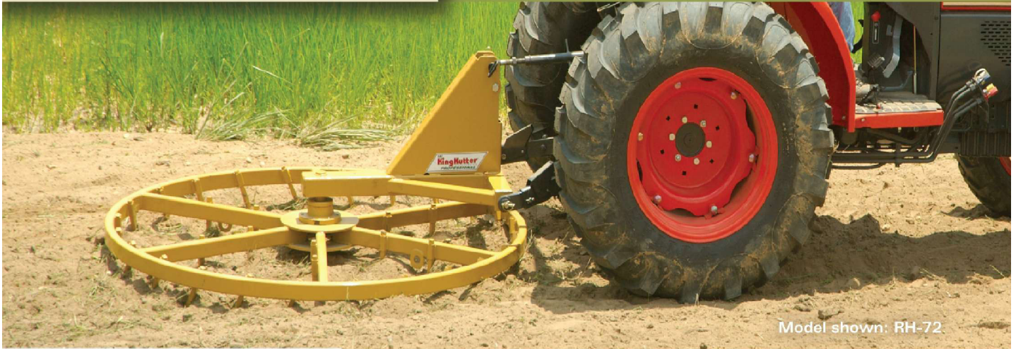
Model shown: RH-72