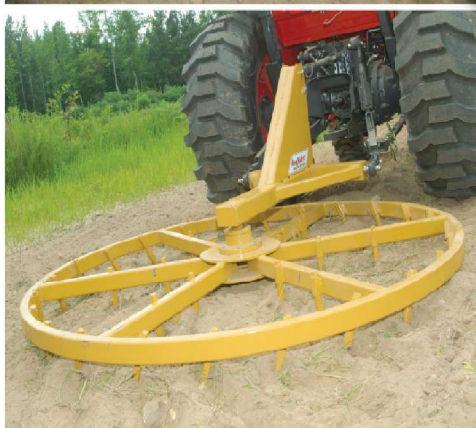
Prepare Soil for Planting