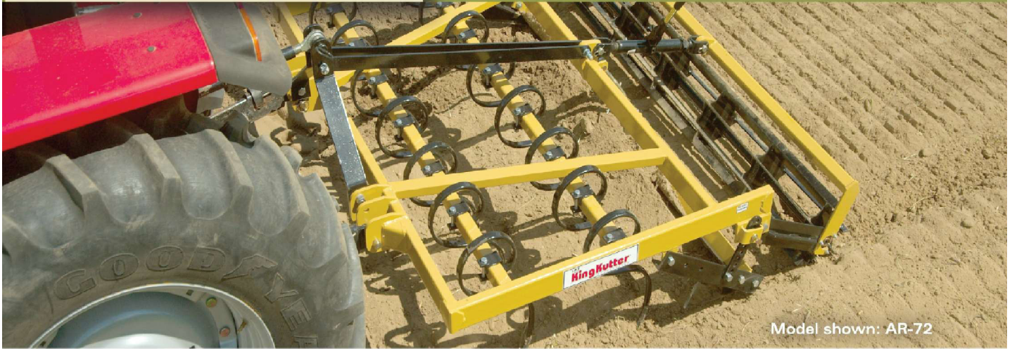
Model shown: AR-72

King Kutter's Arena Renovator is the only fully adjustable Arena Renovator on the market today that does not require tools for adjustment. Through the use of a patent-pending system of adjustable links and pins, the King Kutter Arena Renovator is easily adjustable to fit your specific application. Fifteen high vibration tines and adjustable smoother bar and crumbling basket make this the tool you need for preparing your riding arena.