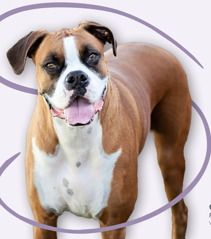
Coco Franklinville, NJ