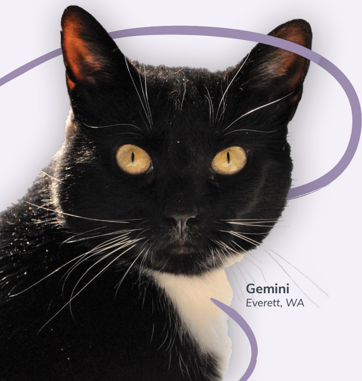
Gemini Everett, WA

As the pioneers in end-of-life care, we seek to actively educate and share our vast reserves of knowledge with other veterinary professionals and pre-professionals, providing critical information that is not taught in veterinary schools. This has substantially contributed to the growth of a new culture of veterinarians, doctors who are learning to treat death not as a failure of medicine, but as the natural progression of biology.