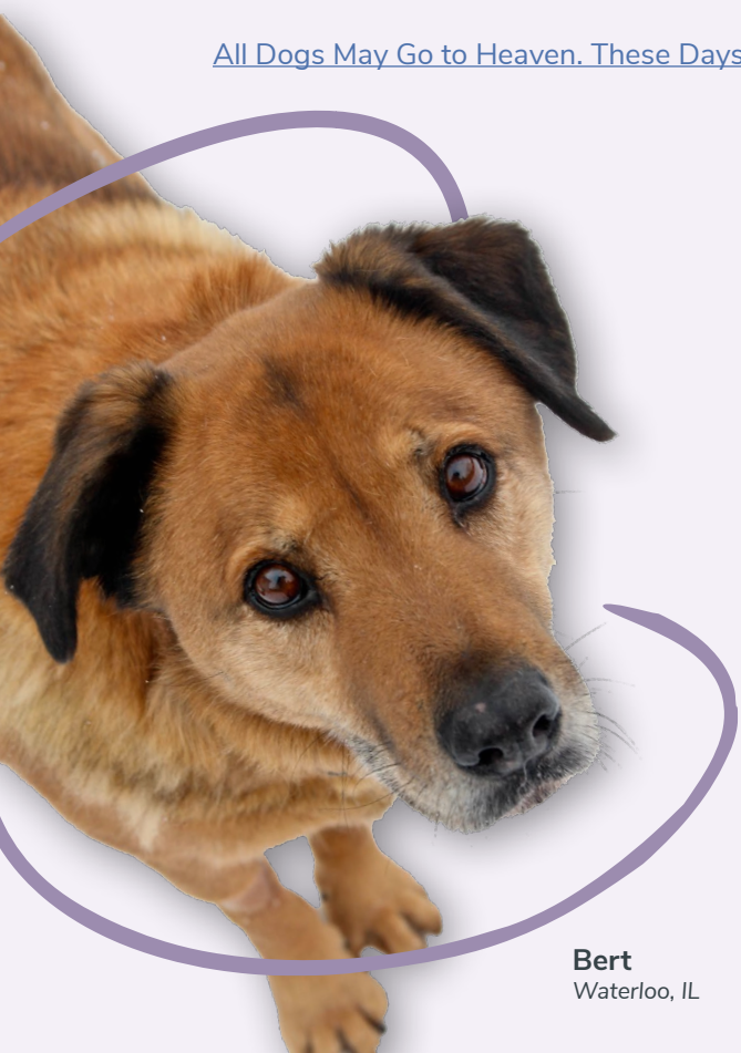
Bert Waterloo, IL