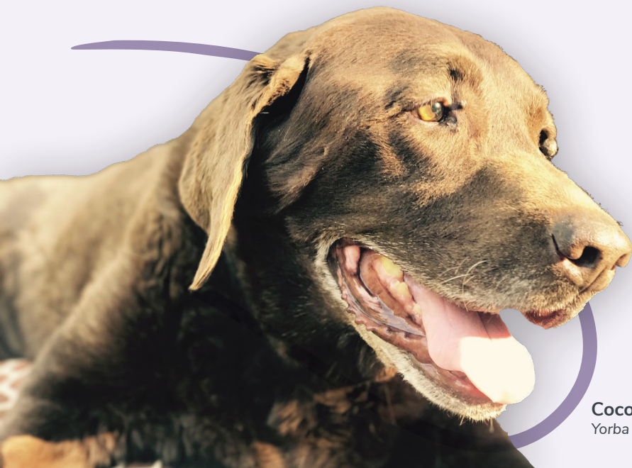
Coco Yorba Linda, CA