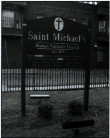
The sign in front of the church long known as St. Michael's names the church St. Michael's on the north side, and on the side facing south, says San Miguel's. Information about services is printed on the sign in both English and Spanish.