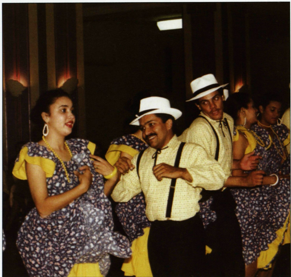
Bobique, a Puerto Rican dancing troupe entertains during one of the first annual Puerto Rican festivals.