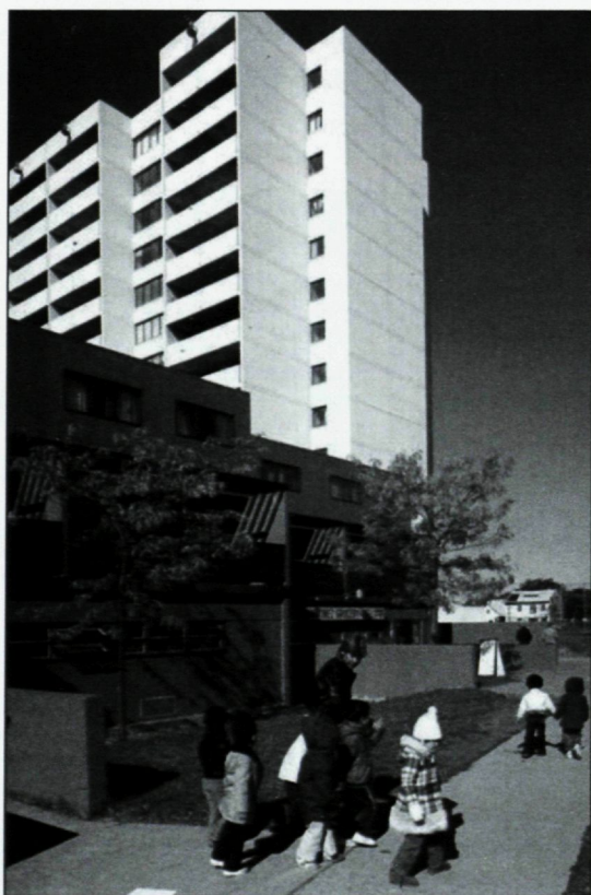
The Los Flamboyantes apartment building at 100 Borinquen Plaza near North Clinton Avenue. The view is to the northwest.