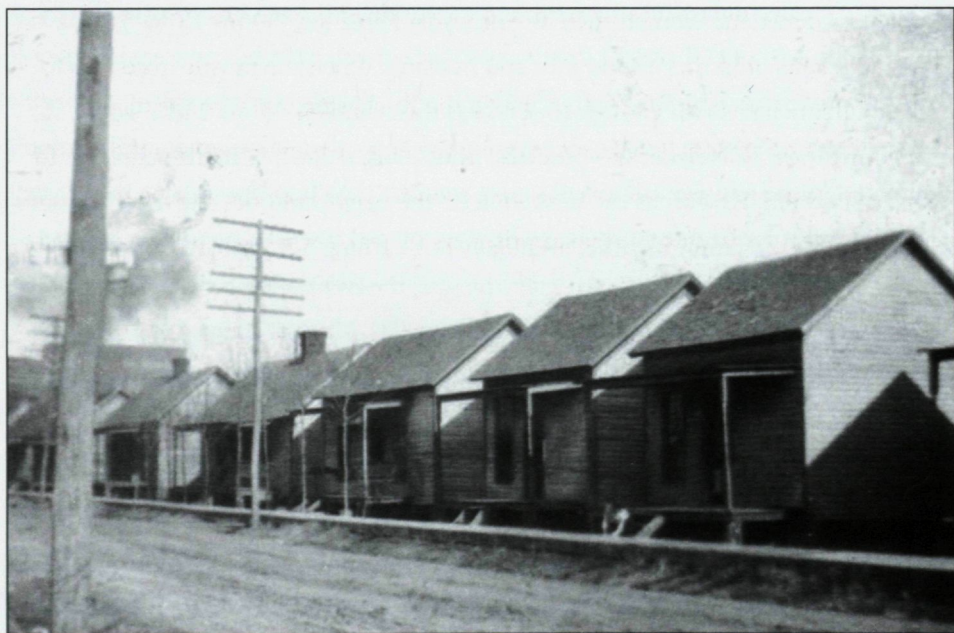
This row of houses, for migrant workers at the Peck & Pratt Canning Company, in Hilton, New York was typical of the 1920s, when this photograph is believed to have been taken, through the 1950s when Puerto Rican workers arrived in large numbers.