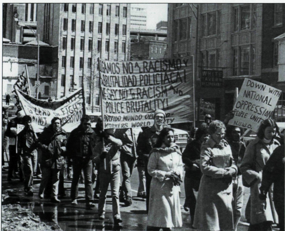
Throughout the 1960s, Puerto Ricans complained of police harassment and brutality. This photograph is believed to be from the February 1969 protest march up East Main Street that followed the police beating of a Puerto Rican youth accused of loitering in Midtown Plaza. The Workers World Party, whose name is attached to the banner in the center, was formed in Buffalo in 1959 and advocated, among other causes, Puerto Rican independence from the United States.

But to some young activists in the Puerto Rican community, Ibero’s successes would ultimately be limited by its focus on individual social services rather than community organization. The phrase “community organizing” was often heard in the 1960s and 1970s, but attempts by its advocates to explain it to others proved difficult. In part, that difficulty was due to the lack of a familiar political framework in which to envision community organizing. It was not a liberal program, but in fact,