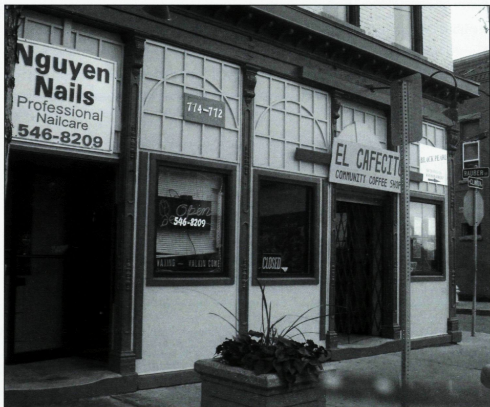
The diversity of the North Clinton neighborhood is clear from these two adjoining establishments, Nguyen Nails and El Cafecito community coffee shop. The coffee shop is also at the corner of Rauber Street, a name retained since the nineteenth century, when the neighborhood was largely German.

This combination of opportunities and challenges shaped the early history of Rochester's Puerto Ricans to a large degree. And, that history has as many strands as there are Puerto Ricans in Rochester. Yet one overarching theme is the effort to carve out space—not only physical space, but social and cultural space as well. Puerto Ricans speak less of neighborhoods than of barrios . The barrio is not a geographic area, but rather a network of families, traditions, and institutions. As the endurance of the festival shows, against great odds, the barrio has adapted and endured.