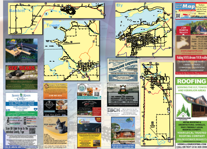
(Actual map size 19"x26")