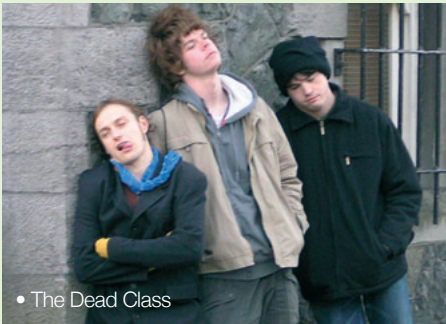
• The Dead Class

The Whole of the Moon combines performances from up and coming bands The Great North Western Hobos, The Dead Class, The Fools, Tahiti's Dream, The Diesel Fitters and Aspen Grove. All performers are under 25 and represent the wealth of contemporary Irish culture that exists in Liverpool's music scene.