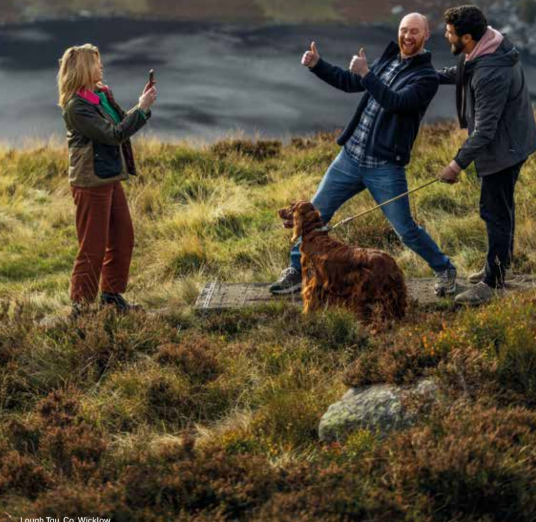
Lough Tay, Co. Wicklow

Start planning your visit now! Discover more on Ireland.com