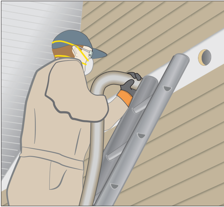
Siding removed and holes drilled into sheathing.