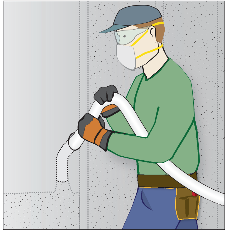
Holes drilled through interior walls allow insulation to be blown into wall cavities