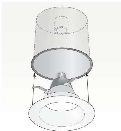
An LED retrofit kit installs in older recessed fixtures. Air sealing at this important leak point is an added benefit beyond the savings of the LED.

Recessed can lights present a large opportunity for improvement in most homes because they typically contribute a large percentage of the lighting electricity load and they are also primary areas for air leakage from the living space into the attic or into spaces between floors. LED retrofit kits are available that address both of these issues. By replacing both the existing bulb and trim with an integrated LED light and trim that is airtight, the fixture will become energy efficient, dimmable and will no longer be leaky.