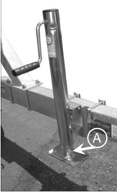
6081.17 2000 lb Capacity