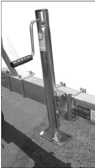
6081.17 2000 lb Capacity Domestic