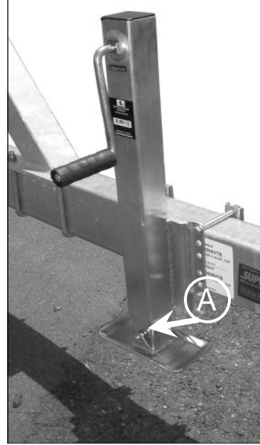
6081.18 2500 lb Capacity