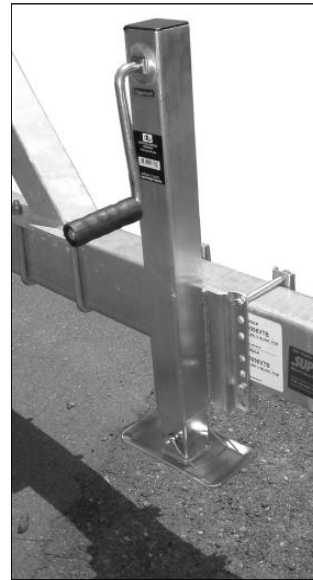
6081.18 2500 lb Capacity Import