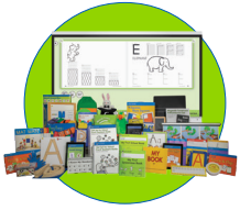
Get Set for School® Pre-K Complete Program