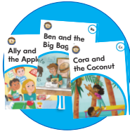
A-Z for Mat Man® and Me Pre-K-1