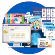
Phonics, Reading, and Me™ K-3