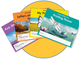
Handwriting Without Tears® ©2025 Pre-K-5