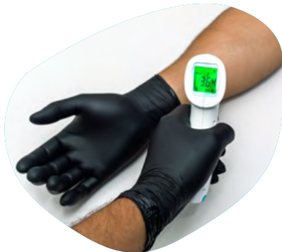
Constantly monitoring symptoms.