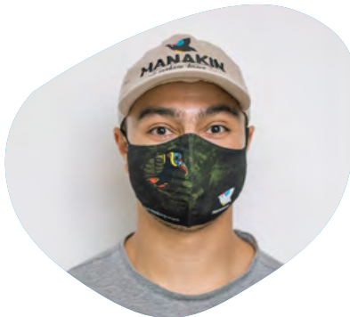
Using a mask as a mandatory measure.