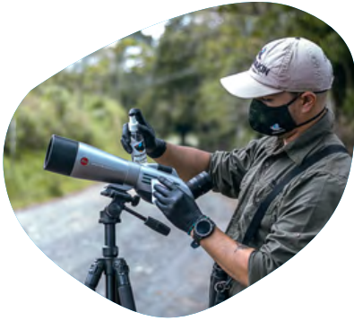
Constantly sterilizing our equipment.