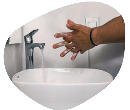
Frequently sanitizing hands.

At Manakin Nature Tours we have designed these recommendations based on national and local regulations, by following them you will help us have a safe and unforgettable trip At Manakin we care about you.