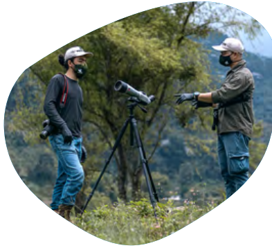
Having an appropriate distancing with others.