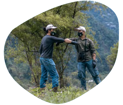
Avoiding hand contact.