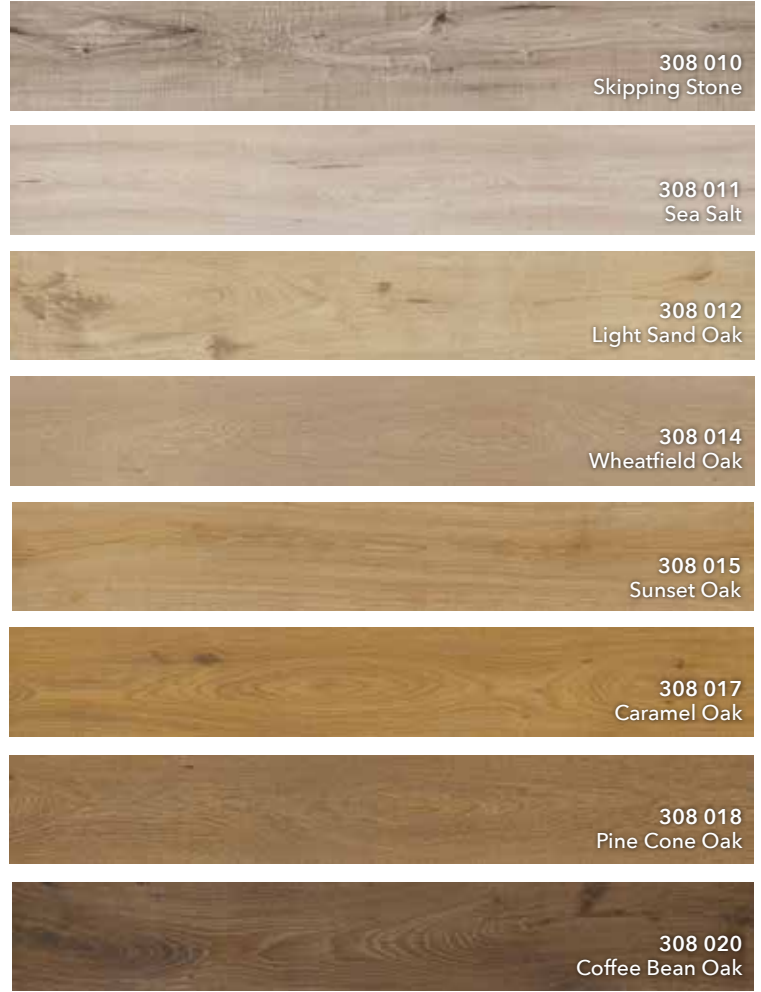
308 010 Skipping Stone