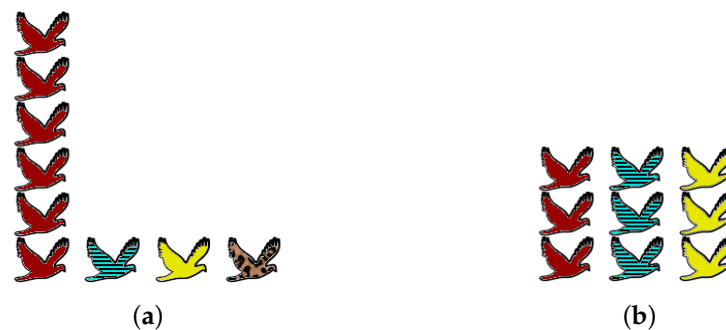
Figure 1. Two bird communities. Heights of stacks indicate species abundances. In (a), there are four species, with the first dominant and the others relatively rare; in (b), the fourth species is absent but the community is otherwise evenly balanced.

Obtaining accurate data about an ecosystem is beset with practical and statistical problems, but that is not the reason for the prolonged debate. Even assuming that complete information is available, there are genuine differences of opinion about what the word “diversity” should mean. We focus here on one particular axis of disagreement, illustrated by the examples in Figure 1.