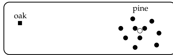
Figure 4. Hypothetical community consisting of one species of oak (■) and ten species of pine (●), to which one further species of pine is then added (○). Distances between species indicate degrees of dissimilarity (not to scale).

conclusion is that if we start with a forest containing the oak and all eleven pine species, eliminating the eleventh should increase diversity.