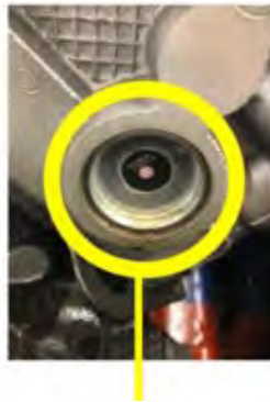
Overheated Pink Sensor 255°F Coolant Temp