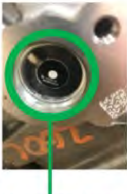
Normal White Sensor

If a customer/independent repair facility (IRF) returns an engine that was purchased over-the-counter with a warranty concern, the dealer will verify that the correct engine was returned by checking the engine serial number, confirm if the part was registered and inspect the heat tabs. If the heat tabs are pink or red, the rules below apply. If the heat tabs are pink or red, confirm a warrantable cooling system failure. If this process is not followed, the dealer could be subject to chargeback for accepting the incorrect or defective engine.