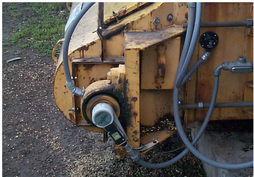
Whirligig installed on an enclosed belt conveyor shown with M800 speedswitch

Please refer to instruction manual for correct installation. Information subject to change or correction. February 2006.