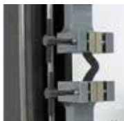
Angle tear strength