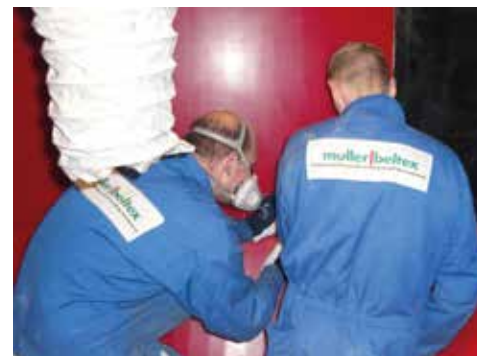
Not binding, subject to change. Version 2017 / 1.1

Slurry pump impellers, sand screw conveyors (classifier shoes), conveyor belt supports, cyclones, pipework systems, sandblasting cab liner, washing systems, dumping box and filter systems, etc.