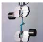
Trouser tear strength