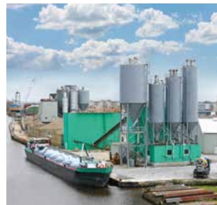
Not binding, subject to change. Version 2017 / 1.1

Concrete mixers, weighing bunkers, silos, pipework systems, chutes, hoppers (sand, gravel and minerals), tip-over and drop points, scrapers, elevators and skirting for belt conveyors, etc.