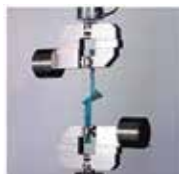
Trouser tear strength