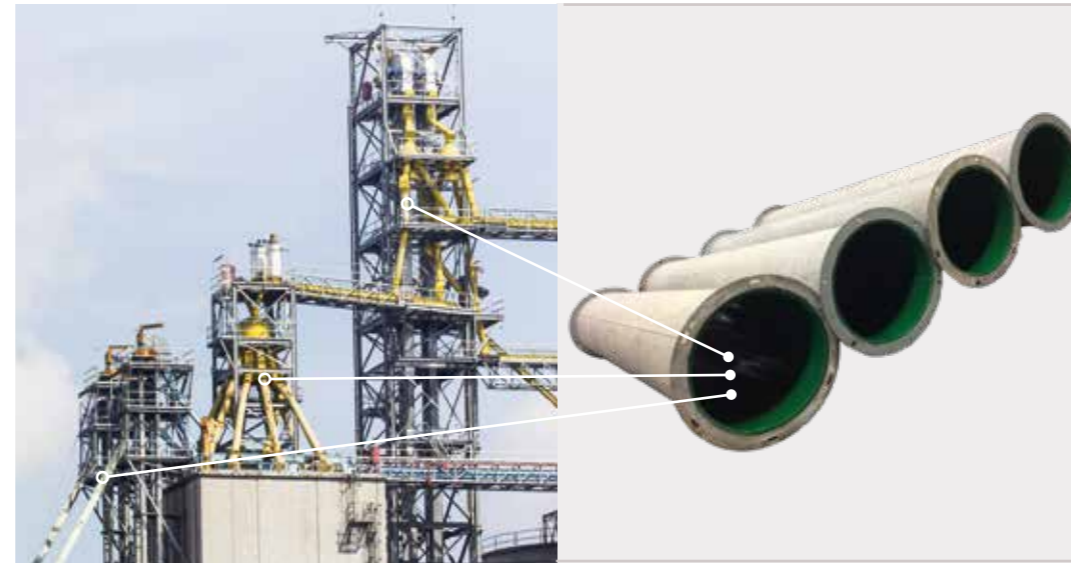
Lined pipework – Kryptane® green

Wear to the steel parts in an installation can only be reduced effectively by a liner that is both elastic and abrasion-resistant. An elastic product absorbs the impact energy well, while an abrasion-resistant product extends the service life and reduces the maintenance cost. These two properties are therefore essential to reducing impact and sliding wear.