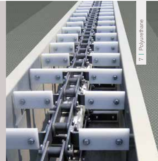
Lined baseplate for chain conveyor – Kryptane® black

ABRASION-RESISTANCE AND ELASTICITY OF POLYURETHANE IS ESSENTIAL TO GIVE AN INSTALLATION'S STEEL PARTS A LONG SERVICE LIFE