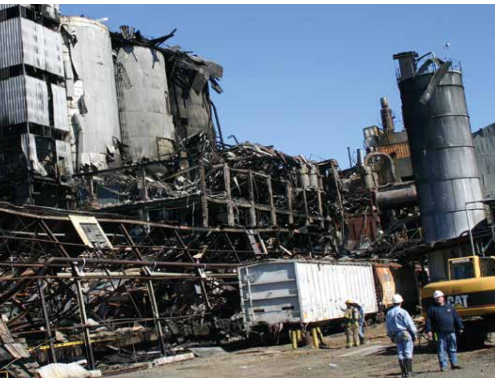
Aftermath of a dust explosion and resulting fire in the bulk and process industry

Process monitoring systems provide valuable insight into the question which factors contribute to the continuity and safety of your equipment and of the environment.