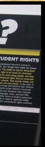
timely top- t increased