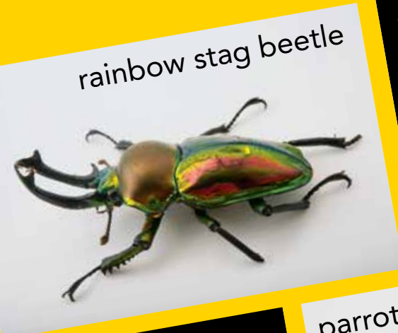
rainbow stag beetle