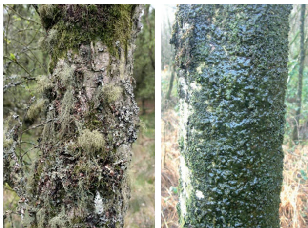
Ammonia can kill tree-living plants (left), replacing them with algal slime.