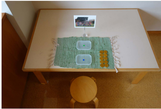
Figure 3. A photo of the experiment environment. Children sat at a desk and decided how to allocate ten chocolates. A male experimenter sat next to the child and explained the rules of the game to the children.

own resources to the recipients than were those in our study. Furthermore, paradigms used in previous studies did not incur a cost to participants to provide ingroup members with resources 38,39 ; this study required children to give up their own resources for the recipients, which may have diminished the desire to provide ingroup members with rewards. Consistent with this hypothesis, Fehr et al. 48 did not find ingroup favouritism in preschoolers using a sharing game similar to the paradigm used in our study, in which sharing was costly to participants. Furthermore, a recent neuroimaging study 59 showed that the cortical thickness of the dorsolateral prefrontal cortex, an area that plays an important role in executive function, positively relates to both age as well as the inhibition of the desire for economic interests in elementary school-aged children. Thus, it is likely that when children must allocate their own resources in order to provide resources to a recipient, it may be more difficult to observe effects of generosity or ingroup favouritism.