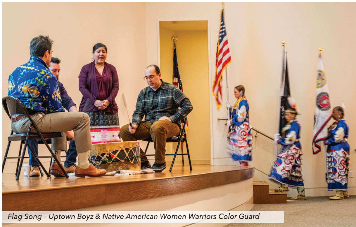
Flag Song - Uptown Boyz & Native American Women Warriors Color Guard

“Learning about the work of Crystal Echo Hawk and IllumiNative was the most valuable takeaway of the day for me. I have shared the website with all of my networks, and it has sparked so much needed conversation, learning, and soon, I hope, action.”