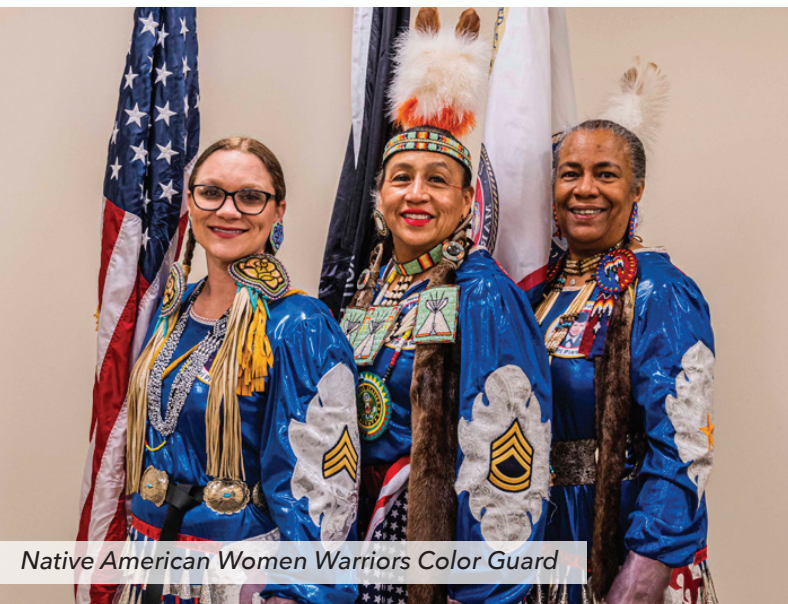
Native American Women Warriors Color Guard

resources and infrastructure, and equitable cultural resource allocation for Native artists/culture bearers/cultural organizations