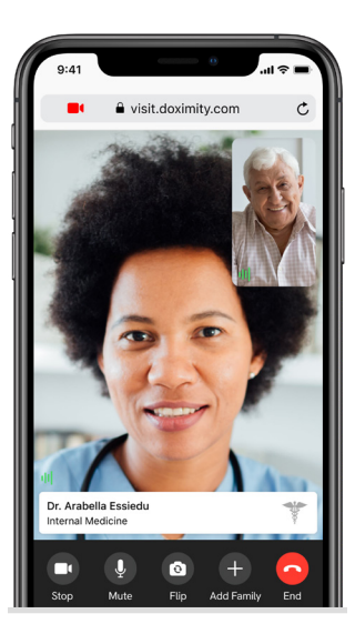
You are now in the video call room and connected with your provider.