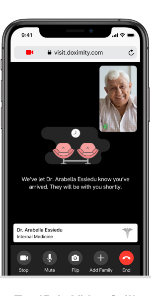
Tap 'Join Video Call' and you'll be brought into the video call room.