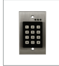
10KEYPAD STANDARD INDOOR KEYPAD