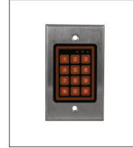
10KEYPADWR WEATHER-RESISTANT, OUTDOOR KEYPAD