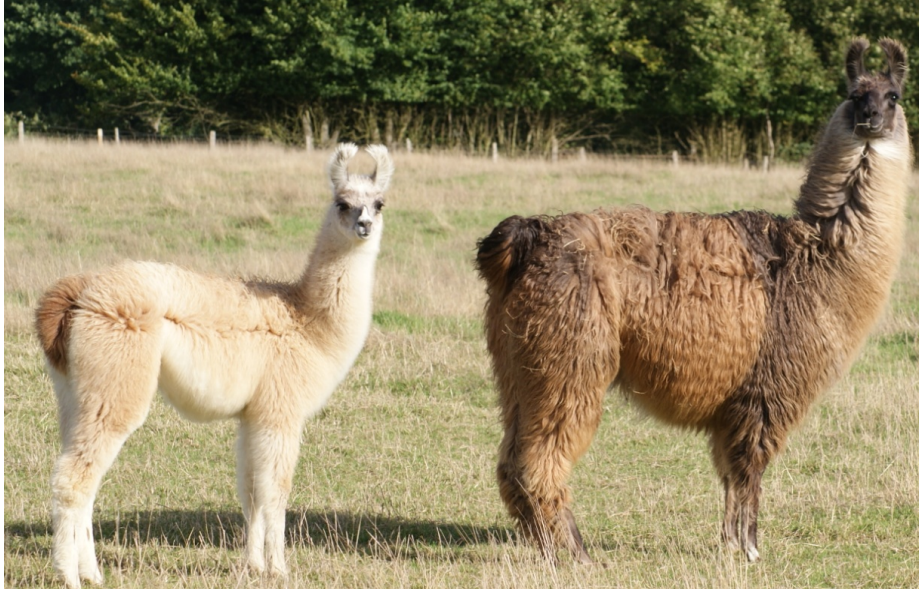
Figure 1. Two llamas: a baby llama, cria (less than one year old) on the left and a yearling on the right