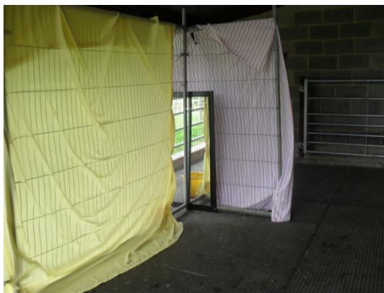
Figure 4. Mirror image of the bucket.

A group of llamas were exposed to a mirror in the enclosure shown in figure 3 for four hours, and the response to their reflection was observed. A different group of llamas were then contained in the same enclosure, for four hours but without the mirror. Each animal was then tested to see if they could use the mirror image (as shown in figure 4) to find a bucket hidden behind a barrier, its true location is shown in figure 5.