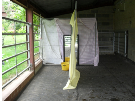
Figure 5. The true location of the bucket.