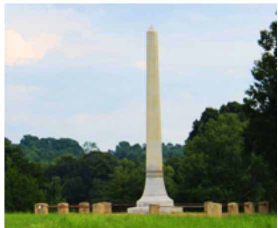
This obelisk stands as tribute to members of the Raine family and marks the family cemetery, which contains nine graves.